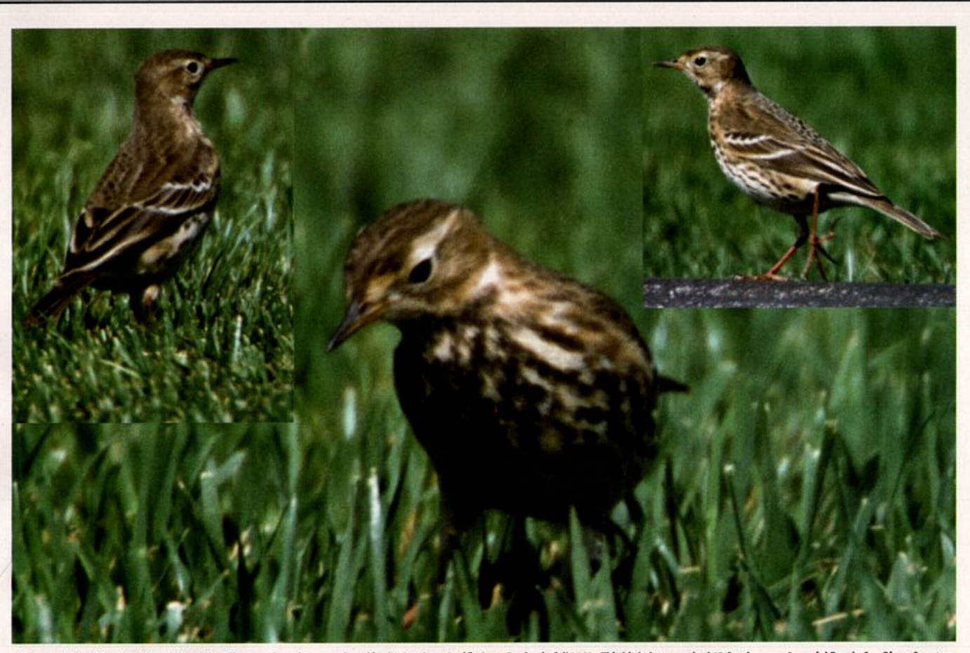
Figure 1. Up to four American Pipits of the Asian race japonicus were found in the Southern Pacific Coast Region in fall 2003. This bird photographed 12 October near Imperial Beach, San Diego County shows the distinctive features of the subspecies, including heavier back streaking, grayer back, bold blackish streaking in the malar area and underparts, and pinkish legs, all distinctions from North American taxa.

That the American landscape will continue to be altered is incontestable: human populations will grow, habitats will be lost, resources will be consumed, and species will become endangered and extinct. The planet's changing climate, whose Big Picture we are slowly coming to understand, will ensure that other, perhaps radical changes in habitats that are forecast will come to pass: Alpine meadows become forested, ice sheets melt, sea levels rise, the Everglades vanish. To step back from the specifics of the regional reports herein, and to imagine the future birdlife of the Americas as different from today as today's is from that of 1604: the Big Picture can seem bleak. After all, who could have imagined two centuries ago that the Passenger Pigeon would become extinct, when clouds of this species once moved like great storms across the skies? We have few quantified data on these birds, just the anecdotal astonishment of observers who found them innumerable. Take heart, then, in the contributions made within these pages. Thousands of birders across the reporting regions have counted the birds they observed, have recorded the details of plumage, habitat, voice, and movement. We are moving away from anecdote and toward serious citizen-derived, citizen-driven sci-