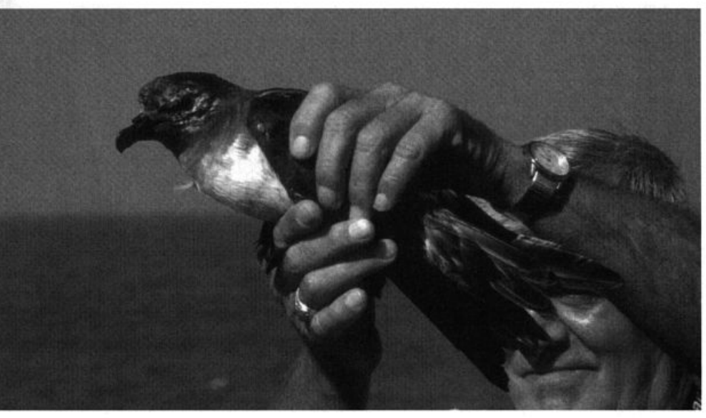
Figure 4. This light-morph Herald (Trinidade) Petrel was found well inland by Brian Patteson after the passage of Hurricane Isabel , on the dam at Kerr Reservoir in Mecklenburg County, Virginia 19 September 2003. It is shown here being prepared for release at the Chesapeake Bay Bridge-Tunnel by Grayson Pearce.

One must wonder how much such a large-scale die-off impacts the overall population of this species in the Pacific. With numbers reported like those of fall 2003, one wonders too what proportion of the birds involved in the incursion were juveniles. Of the age classes documented by specimens during the die-off, first-year birds predominated, which suggests that their survivorship was very low. By early January, however, the majority of Northern Fulmars that I saw in southern California waters appeared to be older non-juveniles. One assumes in most cases that adults and subadults are better prepared than young, inexperienced foragers to withstand periods of prey scarcity (which presumably drive such "invasions"), though it is probably just as likely that the fulmars were concentrated first by an abundance of prey and then affected by some disease that spread rapidly because of their