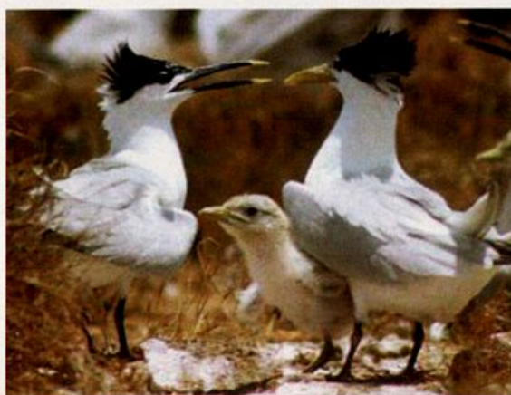
Figure 3. Adult Sandwich Tern (left) and Cayenne Tern (right) with a chick between them at Dog Island, 22 June 2003.

On 26 June, an intermediate tern resembling Figure 2 f (bright yellow patch at base of upper bill) flew into the colony on four occasions and fed a chick under a Sandwich