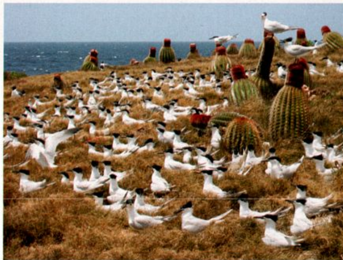
Figure 1. Mixed colony of Sandwich Tern and Cayenne Tern at Dog Island, 28 May 2003.

A mixed colony of 410 breeding pairs of Sandwich Tern ( Sterna sandvicensis acuflyvida ) and Cayenne Tern ( S. s. eurygnatha ) was studied at Dog Island off St. Thomas, U. S. Virgin Islands, during May–July 2003. An estimated 94% of breeders were typical Sandwich Terns (bill black with yellow tip), two (0.24%) were typical Cayenne Terns (bill pure yellow), and the remaining 6% were highly variable intermediates (bill black with yellow/orange blotches or yellow/orange with black blotches). The proportion of Cayenne Terns and intermediate individuals in the Virgin Islands appears to be increasing since the 1980s. Two pure yellow-billed Cayenne Terns, two predominantly (90–95%) yellow/orange-billed intermediate terns, a half-yellow-, half-black-billed intermediate tern, and at least five predominantly black-billed intermediate terns were each mated with a Sandwich Tern, suggesting non-assortative