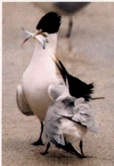
Figure 5. Courtship feeding by a male Cayenne Tern (with two fish) to a female Sandwich-type Tern at Aruba, 1 June 1989.