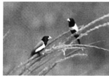
Tricolored Munias (Mannikins) were reported for the first time in Honduras and Belize in July and early August 2003 (here photographed on Caye Caulker, Belize on 4 August 2003). This species—a native of southern Asia and considered a pest in the rice fields of the West Indies and northern South America, where it has been widely introduced—may be staging an "unassisted" invasion of Central America.

Rare in Panama, a pair of Gray-fronted Doves was seen at Isla Bastimentos, Bocas del Toro, and a pair of Olive-throated Parakeets was on nearby Isla Popa 31 Jul (D, D, & CM). The latter species is spreading and becoming more common in nw. Panama, where there had been few reports prior to the 1990s. Green-breasted Mangos continue to be reported in Bocas del Toro: on 31 Jul, a female was observed tending a nest on Isla Colón, and another was seen on Isla Popa (both D, D, & CM).