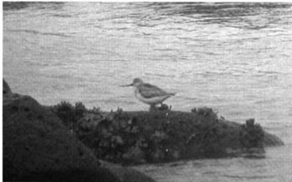
A dream species for shorebirders in most of North America, Terek Sandpiper strays almost regularly to Alaska, where this bird was photographed on St. Paul Island 7 July 2003, a rare mid-summer appearance.

23 Jun (GVV); I know of one prior S.E. summer record. Extralimital Red-breasted Sapsuckers wandered n. and w. beyond normal S.E. breeding zones, with single males reported from Cordova 4 Jun (SB) and Valdez 17 Jun (PW). There