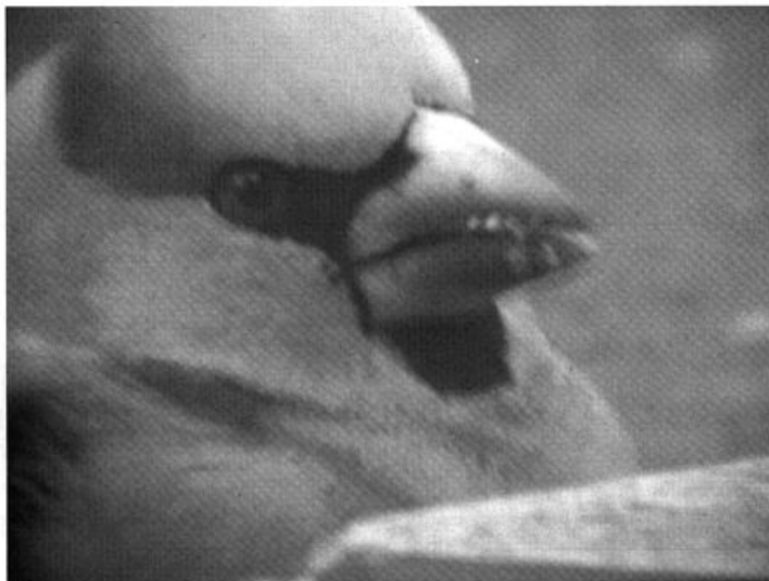
Hawfinch may be increasing as a spring visitor to Alaska; this bird was photographed 6 June 2003 on St. Paul Island. The maximum count here was 7 on 2 June, with the last seen 20 June.

Of the season's few Cedar Waxwing accounts, of a single near Gustavus 27 Jun (ND, PV), was most interesting as a 2nd local record and one beyond typical riparian breeding sites from farther s. in S.E. The season produced about average numbers of unusual warbler observations. Away from standard breeding areas (to the e. inside the Coast Range in adjacent sections of B.C. and the Yukon) were Tennessee Warblers: a single at Gustavus 23 Jun (ND, PV) and 2 in the Juneau area 4 & 10–18 Jul (GVV, PS, SZ, RJG). Appearing w. and n. of known riparian populations in S.E. was an American Redstart in Gustavus 7 Jun (ND, PV), one of few local records. Common Yellowthroats were again reported in the e. Interior, where they have been sporadically noted in early summer and fall, with 2 singing near Northway 20 Jun (RLS, TT). Another singing bird appeared 8 Jul