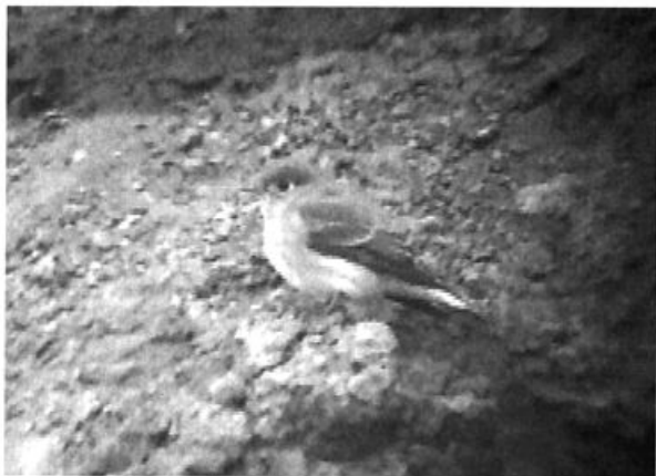
In addition to five Red-breasted Flycatchers and seven Gray-spotted Flycatchers in Alaska in summer 2003 came five rare Siberian Flycatchers, including this bird (not mentioned in the text of this report) at Polovina Hill on the east side of St. Paul Island 13 June 2003. This species has, incredibly, been recorded as a vagrant to Bermuda as well.