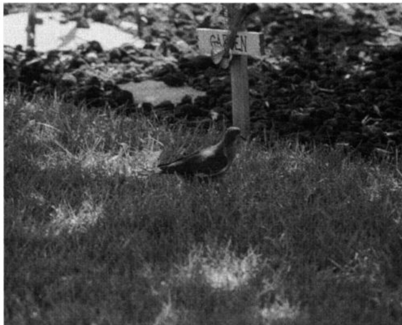
Only Montana's third, this White-winged Dove was captured on film 27 July 2003 at Roundup .

Sharp-tailed Sparrow singing at Bowdoin N.W.R. , MT 27 Jun would, if accepted, provide a first refuge record and the first record for the state away from the extreme ne. corner (p. a., REM). A Slate-colored Junco 6 Jun in Brown , SD provided the first Jun report for this subspecies (DAT).