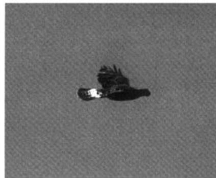
Casual in summer in Montana, Rough-legged Hawk was seen near Freezeout Lake, Fairfield 30 June 2003 (here) and again in July.