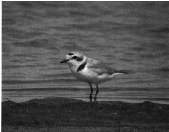
North Dakota's seventh Snowy Plover was nicely documented at Kidder 4 July 2003; all but one of the state reports of the species are from 1999 and later.

An Eastern Towhee spent the season in Ward , ND, an area where only Spotted Towhees are usually present (DW). Henslow's Sparrows were noted in North Dakota for the 6th consecutive year, with a single in Eddy 21 Jun and a pair in Kidder 25 Jun (LDI). The species was also seen in South Dakota again, with a single in Day 13 Jun (LDI). A Nelson's