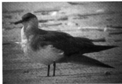
Unprecedented for the state was this Parasitic Jaeger at Pelican Island, Mississippi on the odd date of 26 June 2003.