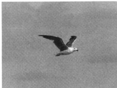
Summering Great Black-backed Gulls in the Gulf Coast states are exceptional and must be carefully distinguished from Herring Gulls and their hybrids (and backcrosses) with Herring Gull. This Great Black-backed near South Pass, Louisiana 18 June 2003 provided one of few June records for the state.