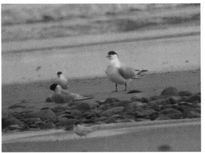
Gracing Laudholm Farms, Maine on 14 June 2003 was this rare Royal Tern.

Despite a serious late-Apr oil spill in Buzzards Bay that oiled approximately 80% of the Piping Plovers nesting in Bristol, MA, 523 pairs of plovers statewide still managed to fledge 1.1 young per pair, a figure only slightly below last year's numbers. Additionally a cool, wet spring and a high incidence of predation this season were thought to be contributing factors to this year's lowered productivity. In the vicinity of Allens Pond, South Dartmouth, Bristol, 28 nesting Piping Plovers picked up at least some oil; nonetheless, 14 pairs fledged 7 young (fide MAS). Given the fact that Massachusetts is steward to approximately a third of the Atlantic Coast population of this threatened species, every young fledged is significant! New Hampshire plovers had similar difficulties, and by late Jun, four out of seven nests failed; however, by late Jul, at least 5 chicks were close to fledging (fide BT). Continued monitoring of American Oystercatchers in Massachusetts this year confirmed 168 breeding pairs with a fledge