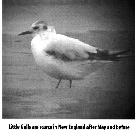
Little Gulls are scarce in New England after May and before the early fall, so this bird at Laudholm Farms in Maine 14 June 2003 (with the White-winged Tern) constituted a summer-season rarity.

Region) registered 1200 pairs, an 8% increase over last season (M.D.F.W.). A total of 5 Little Gulls appeared at various points in Maine, New Hampshire, Massachusetts, Rhode Island, and up to 3 Blackheaded Gulls occurred at Rve. Strafford, NH 3-7 Jul (SM, v.o.), one of which was said to be sporting an Icelandic bird band. Tardy Ice-Gulls land