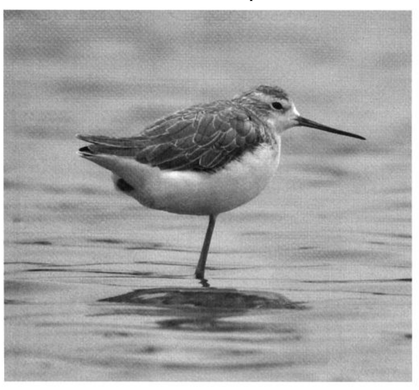
This Marsh Sandpiper provided the second record for the Hawaiian Islands and first record for the main islands. It was photographed 6 February 2003 at the Waiawa Unit of Pearl Harbor N.W.R. on O'ahu.

Region. Single Pectoral Sandpipers were observed at the Kona S.T.P., H. 8 Jan (RP) and at Kii 25 Feb (PD). A lame Sharptailed Sandpiper was seen at Pouhala 14 Dec (PD). Pectoral and Sharp-tailed Sand-