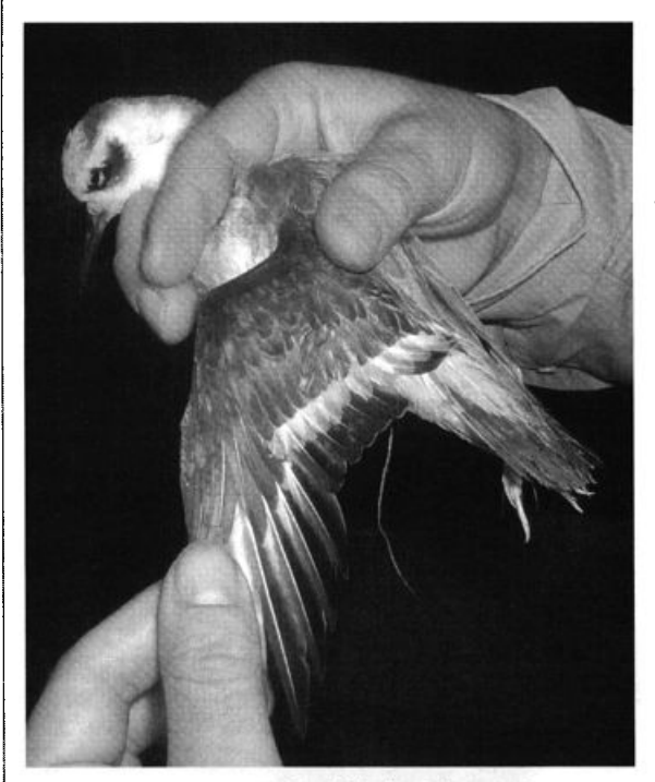
This Red Phalarope was found injured 25 February 2003 at Horseshoe Bay, Bermuda, the first record here since 1971.