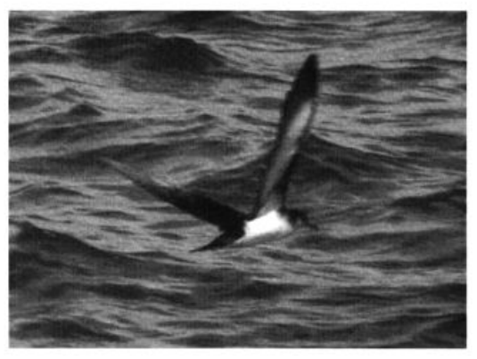
This Manx Shearwater off Dominica was a rare sight 8 December 2002; though probably a regular spring and fall migrant off the Lesser Antilles, as well as a winter visitor, there are no previous confirmed records of this species for Dominica.

dency, and range extensions for warblers and other species (AB et al.). First island records included Yellow-rumped Warblers (one banded, 17 observed) 29 Jan and 2 Kentucky Warblers 6 Jan. Other finds were a Magnolia Warbler 3-7 Feb, 3