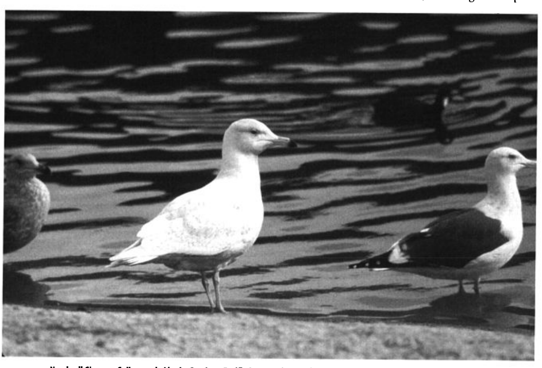
Nearly all Glaucous Gulls recorded in the Southern Pacific Coast Region are first-winter birds, such as this one at Castaic Lagoon, Los Angeles County 28 December 2002.

A very late fall Tennessee Warbler was at G.H.P. 14 Dec (TEW). In addition to small numbers of Nashville Warblers found along the coast from Ventura south, one was at N.E.S.S. 4 Jan (DM). A Virginia's Warbler was also at N.E.S.S. on 4 Jan (SJM), and a late fall straggler was in Santa Ana, Orange 8 Dec (DRW). The only Northern Parula of the season was at Santee, San Diego 26 Dec-2 Jan (MBM). A male Chestnut-sided Warbler was in Laguna Woods, Orange 21 Dec-9 Feb (AM, LLe). A female Magnolia Warbler in Culver City, Los Angeles 5 Jan+ (DS; ph.) was one of the few ever to be found wintering in California. Black-throated Green Warblers returned to El Toro. Orange 7 Dec-19 Feb (GLT) for a 2nd winter and to National City, San Diego through the period (DWA) for a 6th winter. Four Townsend's Warblers during the winter in the Imperial Valley were more than expected (GMcC). Grace's Warblers returning for a 2nd consecutive winter were at Pt. Loma, San Diego 11 Sep-2