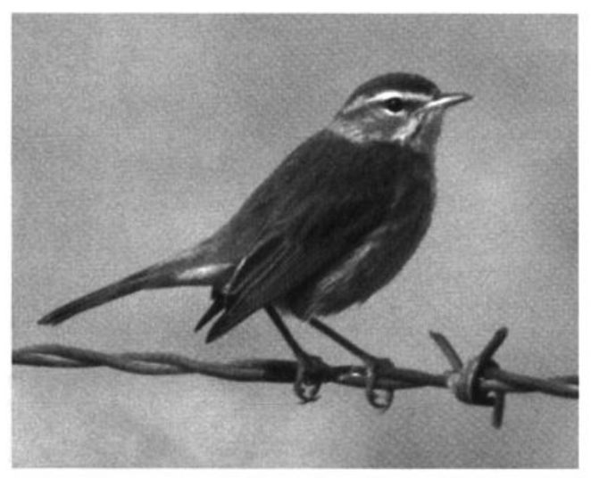
One of the highlights of the season in the Great Basin was a wintering Palm Warbler located on 9 January 2003 at Carson Lake, Churchill County, Nevada. It was enjoyed by many observers through at least 9 March.

al.). Up to 10 were regularly observed in Washington City, Washington, UT and at Springville, Utah, UT. Collared-doves turned up at a variety of new Utah locations as well, including one found on the Dinosaur-Jensen C.B.C., Uintah 4 Jan (fide KPa), 6 on the Cedar City C.B.C., Iron 20 Dec, which were seen again 12 Jan (SH, SS et al.), and 2 at Minersville, Beaver 27 Feb (SS). White-winged Doves rarely winter in the Region, so a flock of 6 observed throughout the season in Washington City, Washington, UT was very unusual. A Northern Saw-whet Owl was reported from Stillwater 26 Dec (WH). Reports of Anna's Hummingbirds are becoming increasingly common in the Great Basin, especially during the winter season. Several were reported from the s. portion of the Region (Clark, NV, and Washington, UT), with a high of 4 at Leeds 21 Jan (CS). A few wintering Costa's Hummingbirds were also reported from Clark, NV (RS, JCo). A few scattered Lewis's Woodpeckers were reported wintering in the Region (Clark, NV and Utah, Iron, and Washington, UT). An Acorn Woodpecker, originally found on 15 Oct (DSh), remained along Hwy 12 n. of Boulder, Garfield, UT through the winter (KCh, RTu et al.). A Yellow-bellied Sapsucker spent much of the winter at Lytle 18