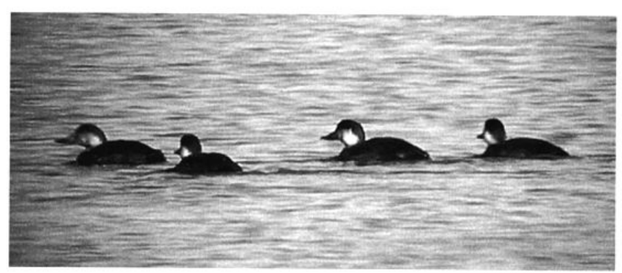
These four Black Scoters—a large flock for Colorado!—were at Cherry Creek Reservoir, Arapahoe County 13 December 2002.

Eastern Bluebirds were found at eight locations in e. Colorado, and 5 Hermit Thrushes were reported in Colorado this season. A Varied Thrush was at Alcova.