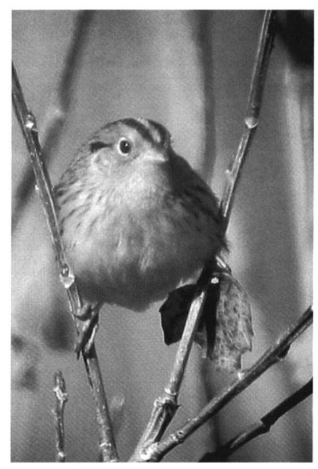
This Le Conte's Sparrow was one of at least eight that wintered in the marshes east of Fort Lyon, Bent County, Colorado 20 December 2002 (here) through at least 27 February 2003.

Natrona, WY 1 Jan (BR, fide CEM), with 4 reported in Colorado: a female in Pueblo City Park 27 Dec-15 Mar (DC, KT, m. ob.); a female in Fort Collins 1 Jan+ (CB); one in Beulah, Pueblo 5-10 Jan (fide VAT); and a male near Rush, El Paso/Elbert 1-22 Jan (fide LL). Six Gray Cathirds were reported in Colorado this season, including one near Eagle, at 2235 m elevation 23 Jan-1 Feb (JMe). A Northern Mockingbird was at Bates Hole, Natrona, WY 1 Jan (J&GL, side CEM), and at least 6 other Northern Mockingbirds and 7 Brown Thrashers were found this winter in e. Colorado. The only Bohemian Waxwings reported were singles in Ft. Collins 1-3 Dec (RH, IMa) and Pueblo 5 Dec (BKP).