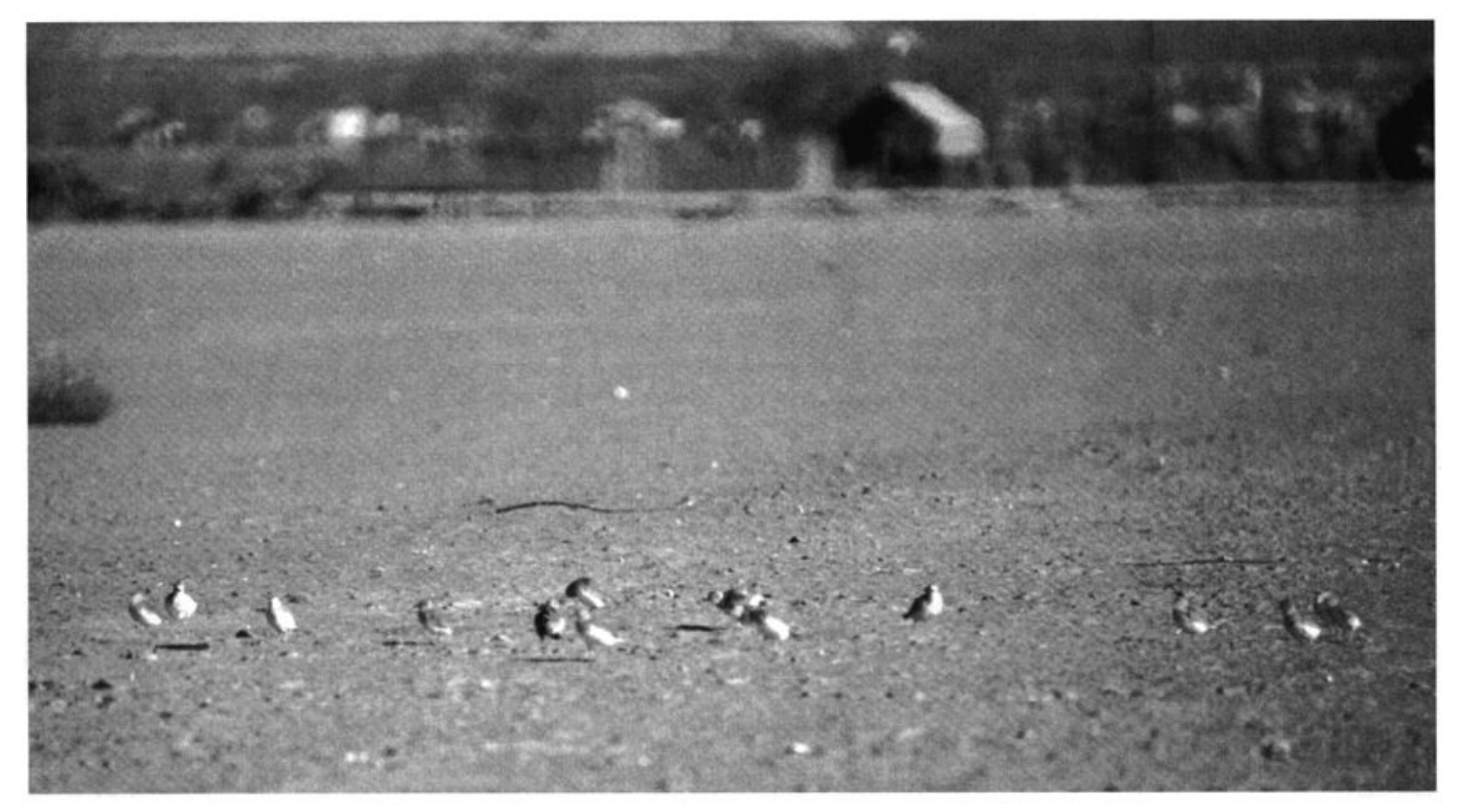
Mountain Plovers were not known to occur in the Trans-Pecos during the winter prior to the discovery of 209 at Dell City on 3 December 2002. The birds could not be found during January or February, suggesting they may have been moving through the Region to wintering areas farther south.