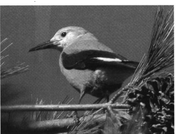
Clark's Nutcracker had not been seen in three decades in Missouri, so this bird at Busch Conservation Area in St. Charles County 21 December 2002 was the pearl of the holiday season, without question.