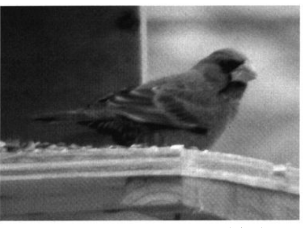
A Blue Grosbeak is hardly an expected winter visitor to Illinois, which has only one previous winter record. This immature male, believed to have been present all winter, was photographed 1 March 2003 at a Palos Hills, Cook County feeder.