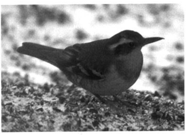
This Varied Thrush that visited a feeder at McKean, Pennsylvania periodically from 1 January (here) to 9 February 2003 represented just the second Erie County record.

The Green-tailed Towhee previously reported as visiting a feeder near Centre, Juniata , PA in Nov (T. Petersheim) lingered through 1 Dec. More than the usual number of wintering Eastern Towhees was observed