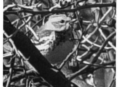
This Black-throated Green Warbler surely brightened the C.B.C. season near Pennsbury Manor, Falls Township, in Bucks County, Pennsylvania 14 to (here) 22 December; there are no previous winter records for the state.

in Pennsylvania, indicated that the severe