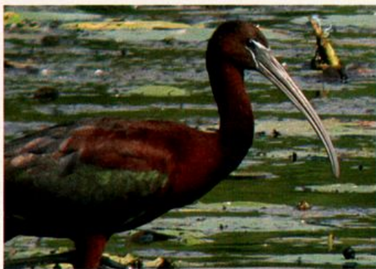
Figure 1. Typical adult Glossy Ibis in breeding condition at Salt Plains N.W.R., Oklahoma 6 July 2002. The dark brown eye and blue-black facial skin with borders, above and below, of bluish-white lines are characteristic of breeding birds.