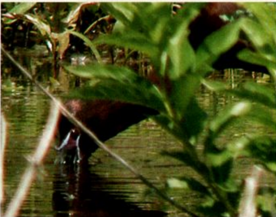
Figures 8 & 9. Adult breeding-condition Plegadis hybrid at Salt Plains N.W.R 30 May 2002. This bird looks like a Glossy at a distance, but notice the red in the eye, some white feathers above the loreal stripe and near the gape, the clearly blue lines forming the borders of the bare facial skin (upper thickening), and the largely plum-purple tone to the remaining facial skin.

Nonetheless, the occurrence of these intermediates adds a new consideration to identification issues for extralimital Plegadis ibises. Although hybrids would not be expected in the first wave of extralimitals, the vagrancies in these species now include much of the contiguous United States where one of the cohort species is very rare relative to the other. Hybrids should be considered carefully in each instance of potential vagrancy. Documentation is still critical in assessing biologically meaningful distributional patterns of these species.