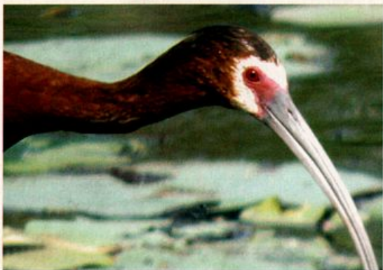
Figure 2. Adult White-faced Ibis in breeding condition at Salt Plains N.W.R. 5 July 2002. White feathers surround the facial skin and red eye. The facial skin appears pinkish-red. Note the pale eyelid.

lines appear to circle behind the eye and connect (Grzybowski, pers. obs.). In both cases, the pinkish, red or maroon facial skin readily distinguishes these birds as White-faced.