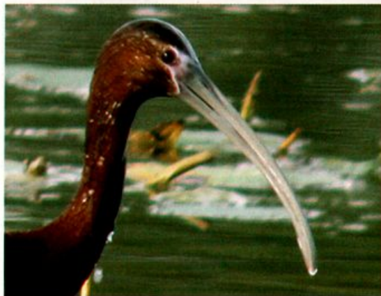
Figure 7. Hybrid Plegadis (possibly subadult) at Salt Plains N.W.R 6 July 2002. The eye is brown with patches of red, and the facial skin has plum-purple and gray coloration. The lines forming the borders of the facial skin are mostly plum-purple, with some areas of blue-white (upper) and white (lower), the upper line thickening. Note the eyelids of this bird are dark.