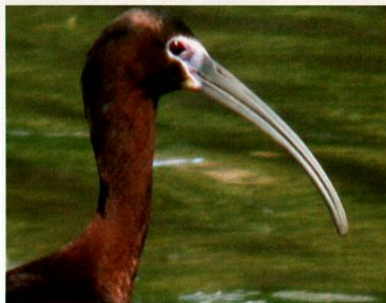
Figure 6. Hybrid Plegadis (possibly subadult) near Salt Plains N.W.R 6 June 2002. The eye is mostly red, and the facial skin has pink, plum-purple, and gray coloration. The lines forming the borders of the facial skin are white, the upper line thickening; the pale eyelid makes them appear to connect behind the eye. Also note white feathers above the loreal stripe and near the gape.

Patten and Lasley (2000) anticipated that with the expansion of both White-faced and Glossy Ibises, hybrids would be found. Whether this will be a pattern occurring broadly or one of occasional local occurrence depends presumably in large measure on the effectiveness of current isolating mechanisms. Given that hybrids have been rare to date even when looked for, isolating mechanisms between these species may be effective. We would, thus, predict frequencies of hybridization similar to those for waterfowl, occurring only occasionally where vagrants in breeding condition encounter localized breeding populations of the regionally expected species.