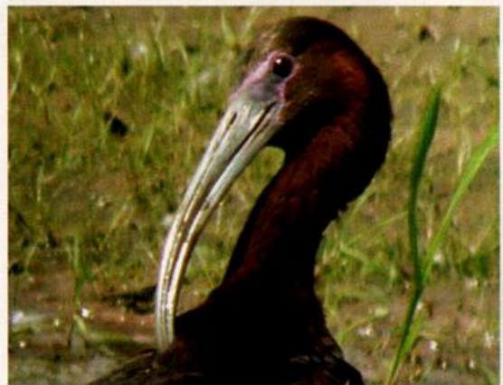
Figure 10. Apparent subadult Plegadis hybrid or variant White-faced Ibis near Salt Plains N.W.R 30 May 2002. This bird may be a White-faced in retarded juvenile color (see text). The brown eye has slight flecks of red. But notice the largely plum-gray facial skin with brighter patch anteriorly, as well as the pale plum or maroon lines forming the borders of the facial skin, tones characteristic of the other intermediates.