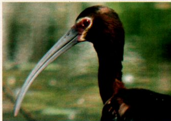
Figure 3. Another adult White-faced Ibis in breeding condition at Salt Plains N.W.R. 7 June 2002. Note the bright red eye and rich maroon facial skin of this bird.