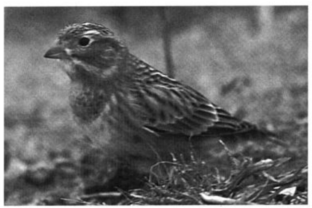
Two McCown's Longspurs were recorded on San Clemente Island this fall, including this cooperative adult male photographed 24 October 2002 at Lemon Tank, along with a first-year female at the same location 8 October. These observations represent the first two records for San Clemente Island, and two of three records for the California Channel Islands, the first being of a male on Santa Barbara Island 1 July 1981.

Only about 30 Bobolinks were found along the coast 6 Sep—31 Oct; another 4 were on the deserts 14-29 Sep. Rusty Blackbirds were at Panamint Springs, Inyo 2-3 Nov and F.C.R. 2-5 Sep (CH, RBe), and coastally on San Clemente I. 24 Oct (BLS) and near San Pedro, Los Angeles 16-28 Nov (DMH). Great-tailed Grackles continued their increase on the n. coast, with flocks of 20 in Morro Bay 4 Aug (MDH) and 25 at Oceano 1 Nov (TME). A Common Grackle (of the expected subspecies versicolor ) was at Panamint Springs 3 Nov