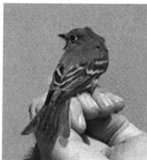
This Alder Flycatcher on Southeast Farallon Island 25 October to 2 November 2002 was the island's second and second for the Region.

(i.e., no reporting from Del Norte , no county compiler for Marin ), we tallied only 364 vagrant warblers of 24 species. These figures are quite similar to autumn 2000, when overall numbers were down 41% from a six-year (1994-1999) average. Compared against that same average, vagrants warblers in fall 2002 were down 36%, and the trend was felt "across the board," with eastern-origin species down 35%, southeastern origin warblers down 16%, and southwestern warblers down 53%. Palm and Blackpoll Warblers and American Redstart,