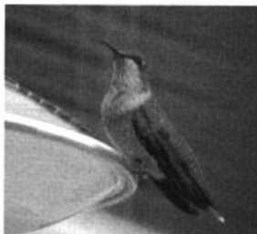
California's fourth Ruby-throated Hummingbird was near Arcata, Humboldt County, 25 to 29 (here 28) September 2002.

The Region's first chaseable (and 4th overall) Ruby-throated Hummingbird was an imm.