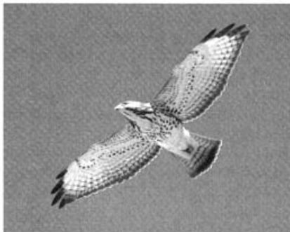
Broad-winged Hawks have proven to be regular migrants in small numbers at the Grand Canyon hawkwatch sites in late September, with daily counts as high as five birds. This bird was photographed here 25 September 2002.

along Sonoita Cr. near Patagonia 13 Oct (RB). Similarly, Western Kingbirds were reported later than usual, with one in the Santa Cruz Flats on the very late date of 28 Nov (JC). Seemingly rarer in Arizona as a migrant than it was in the 1970s and 1980s, 2 Eastern Kingbirds were at Paloma, one 14-15 Sep (PM, ph. RJ) and another 15 Sep (PD; ph.