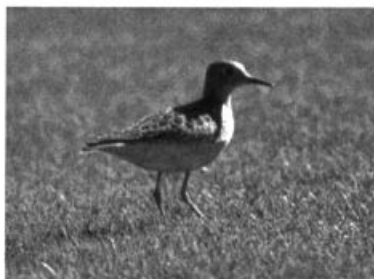
At long last, Arizona's first documented Buff-breasted Sandpipers came this season, from Paloma 11-12 September 2002 and this juvenile at a sod farm east of Scottsdale 22 (here) to 29 September 2002. The only previous report is from September 1993.

(DR); this species is still considered rare but is annual in very small numbers during the fall. A Hermit Warbler was at Cholla L. 29