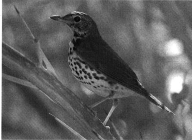
This Wood Thrush at Boyce Thompson Arboretum State Park near Superior, Arizona 20 October to 3 November 2002 (here 27 October) furnished one of about 20 records for Arizona.

areas of occurrence were of singles in Mesquite Wash along Hwy 87, Maricopa 19 Oct (TC), at Cameron 22 Oct (CL), at Pena Blanca L. 18 Nov (SH), and at Kino Springs 30 Nov (JC). A greater-than-usual number (18) of White-throated Sparrows was reported around the state, many from n. Arizona beginning in early Oct. More scarce,