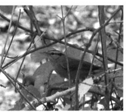
Utah's second reported but first documented Wormeating Warbler was found 28 September 2002 during a local Audubon Society field trip. It was feeding in a campground riparian area at Red Cliffs Recreation Site, Washington County.