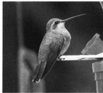
This female Broad-billed Hummingbird, a state first, was at Clifton, Mesa County, Colorado, 12 November through 22 December 2002, here photographed 14 November.