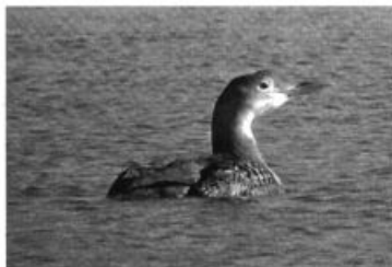
This juvenile Yellow-billed Loon was found at Boyd Lake, Larimer, Colorado on 10 November 2002. The species has been annual in the state in the last decade.