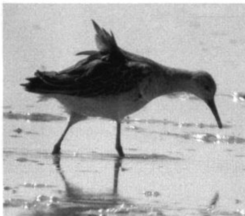
This juvenile Ruff at Lake Meredith, Crowley County, Colorado was present 5-8 (here 6) October 2002 and constituted Colorado's second state record.

The dearth of cold fronts contributed to a lackluster warbler migration in the Region. Rare in fall, a male Blue-winged Warbler was at Pueblo City Park 23 Oct—1 Nov (BKP, KH, m. ob.) and was probably killed by an Accipiter 3 Nov. This bird was joined by a duller Blue-winged on 28 Oct (CLW et al.). A Magnolia Warbler was reported from Chaffee 10 Oct (RM). Blackburnian Warbler reports hailed from Ft. Collins 20 Sep (JBn, v. o.) and at Dixon Res., Ft. Collins 29 Sep (NK). Single Pine Warblers were observed w. of Pueblo 27 Aug (BKP) and 17 Sep (MY), at Chatfield Res. 8 Sep (AS), and at Pueblo City Park 28 Oct (CLW et al.). A first-fall Prairie Warbler was at C.V.C.G. 3 Sep (JBF, BKP, RH, DAL, JH), and another was seen in Chaffee 10-11