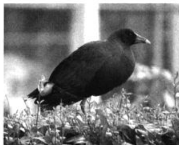
This adult Purple Gallinule was found in a backyard in Loveland, Colorado (here 27 August 2002); it furnished a second state record.