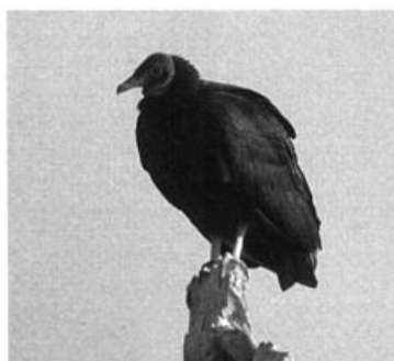
A first documented record for Colorado, long expected, was this Black Vulture at Hasty Campground 14 August 2002.