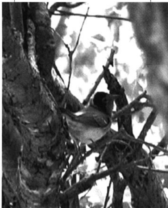
Red-faced Warbler has become an annual late-summer visitor to the Chisos Mountains in Big Bend National Park, Texas. Four were documented this year, including this long-staying bird that was present 23 July—25 August 2002 (here 16 August).