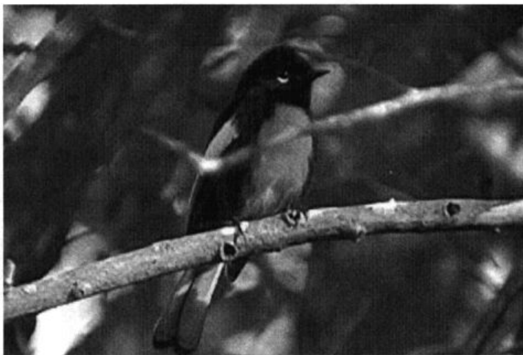
This Painted Redstart provided a very rare documented record for the Lower Rio Grande Valley of Texas at Edinburg, Hidalgo County 3 November (here 4 November) 2002 through the end of the month.

The invasion of Golden-crowned Kinglets this season into the Oaks & Prairies region of cen. Texas was impressive and, perhaps, the greatest seen in decades (m. ob.). A very good find was 11 Western Bluebirds in Adrian, Oldham 20 Oct (BPi, ph.). Three Mountain Bluebirds at Village Creek Drying Beds, Tarrant 11 Nov were early and somewhat farther e. than expected (JC). A single Townsend's Solitaire in El Paso 21 Sep was the earliest fall record for the county (BZ). A Veery at Quintana, Brazoria 4 Nov was apparently a new late record for the U.T.C. (CB et al.). A Wood Thrush was at El Paso 7 Oct (BZ), providing a 4th county record. A male Varied Thrush in El Paso 24 Nov was a 3rd county record (†, ph., JPa). A very early Sage Thrasher was in Moore 19 Aug (KS), and others wandered eastward to Throckmorton 12 Oct (BG, PB), to O.H. Ivie Reservoir, Coleman on the same