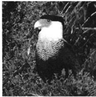
The first documented Crested Caracara for the Southern Great Plains Region was this adult near Perry, Noble County, Oklahoma 4-7 November 2002. The species was found, potentially as genuine vagrants, from central California to Iowa to New Brunswick, Canada this season, almost all subadult or juvenile birds.

A White-winged Dove was still surprisingly as far n. as Kimball , NE 26 Aug (CW), part of the continued expansion. Several groups have established themselves in Lawton , Oklahoma City , and El Reno , OK. Inca Doves are also scattered out over the s. parts of the Region, with a high count this season of 10 in Stevens , KS 22 Sep (SS, MR, DK). A Common Ground-Dove, quite the rarity, was in Sedgwick , KS 8 Oct (RG et al.). Single Snowy Owls were in Burt , NE 26 Nov ( fide WRS) and Holt , NE 28 Nov (DSt), perhaps an echo of last year's invasion. Quite tardy was a Common Nighthawk 12 Nov (!) in Osage , KS (EW); any nighthawk this late should be checked for vagrant species.