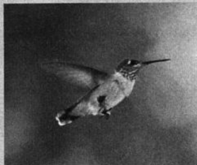
Among the impressive showing of Calliope Hummingbirds, particularly in the southern Great Plains, was this bird, the second for Oklahoma in Cimarron County 4 August 2002.

SA The western Kansas hummingbird phenomenon spread this season! Suffice it to say that both Ruby-throated and Black-chinned Hummingbirds were seen in small numbers in western Kansas. Calliope Hummingbirds , now so numerous that they are difficult to track, included up to 3 birds at three locations in Cimarron , OK 4 Aug—20 Sep (SM, JWA, m. ob.). One was photographed e. to Custer , OK 17 Aug (J&DR). Kansas signed in with up to 4 Calliopes at several feeders in Finney , KS 4 Aug—13 Sep (MOs, T&SS, m. ob.), while reports of one to 3 Calliopes came from Sherman (JP), Sedgwick (NC), Haskell (J&NC), and Morton , KS (BPe, PJ, m. ob.) as late as 20 Sep. Five or 6 were reported from Nebraska, the easternmost and only record outside the Nebraska Panhandle being in Knax 19 Aug—13 Sep (MB, BP, LP, m. ob.); others in the Panhandle spanned 24-31 Aug, including documented birds in Scotts Bluff 24 (KD) & 25 Aug (WRS), and Kimball 26-31 Aug (CW, MB).