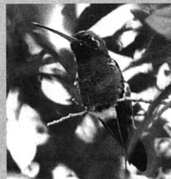
A Broad-billed Hummingbird, first for the Southern Great Plains Region, appeared in Lawton, Comanche County, Oklahoma in mid-October 2002 (here 21 October) and stayed through the period.