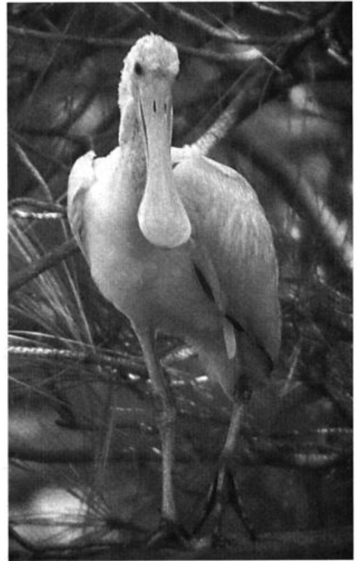
One of many Roseate Spoonbills reported from the Region, this one was found 24 August 2002 in southern Mobile County, Alabama.