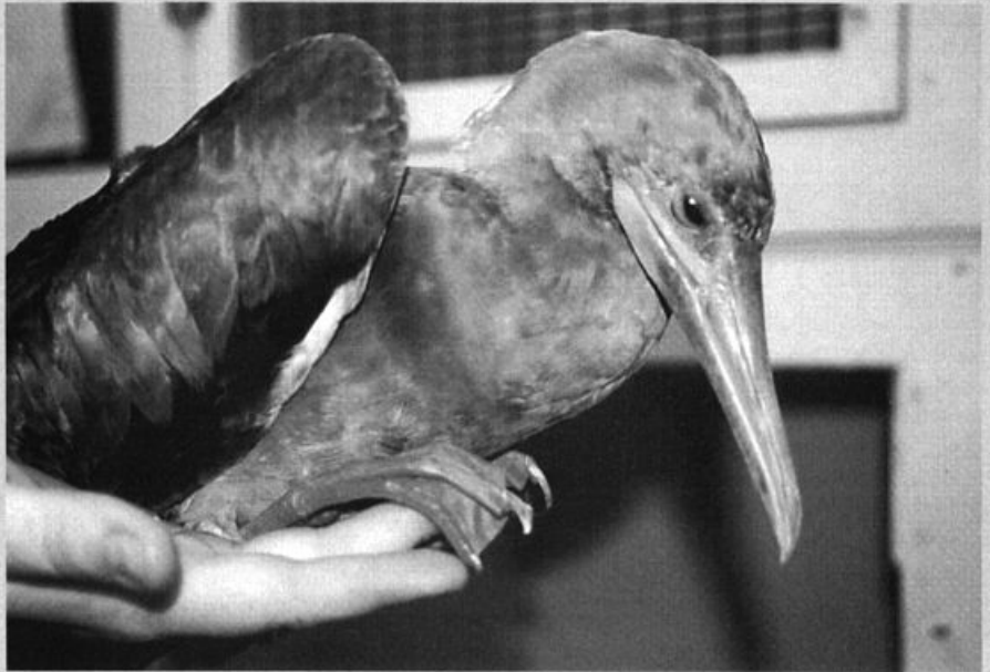
One of three Red-footed Boobies discovered in northwest Florida, this bird was found in Gulf Breeze 28 September 2002 on the heels of Hurricane Isidore .

Specimens discovered as a result of tropical storms have great value for the ornithological record. Wildlife rehabilitation and sanctuary facilities can play an important role in identifying and preserving avian specimens for educational institutions. Among the records established through these facilities in the Central Southern Region alone in the last few years have been pelagic species including Red-billed Tropicbird, Red-footed Booby, Sooty and Bridled Terns, three species of storm-petrels—not to mention Flammulated and Northern Saw-whet Owls! A working relationship between the operators of these valuable facilities, regional editors, and collection managers can produce valuable information and study skins, especially if a protocol for data collection is maintained by the facility. Potential contributors of specimen material should consult their local museum or bird rehabilitation facility to learn more about regulations governing the salvage of bird specimens.