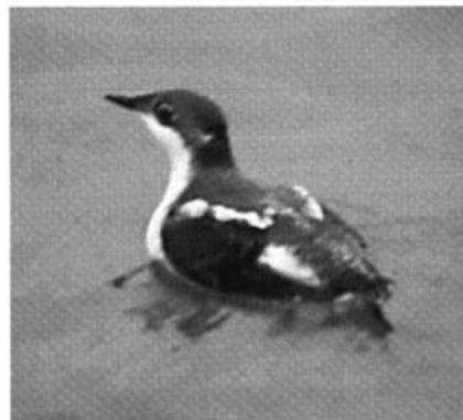
This Long-billed Murrelet surprised and delighted Kentucky birders on the Ohio River near Louisville, Kentucky 29 to (here) 30 October 2002, a first for the Tennessee & Kentucky Region.