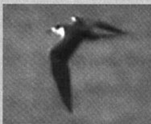
This Sooty Tern (videotaped near Kentucky Dam) was one of at least five individuals observed in west Kentucky and west Tennessee on 4 October 2002 during the passage of the remnants of Hurricane Lili. A week earlier, the remnants of Hurricane Isidore had deposited two in east Tennessee.