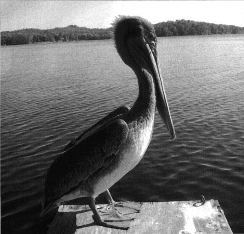
A frisky juvenile Brown Pelican—Michigan's second for the season—spent time at Philomena Resort, Lake Michigamme in Marquette County. The bird was present here from 17 August to 2 September 2002, and thanks to the hole visible in its left foot, was traced via photographic evidence to western Québec, then eastern Ontario in mid-September through early October.