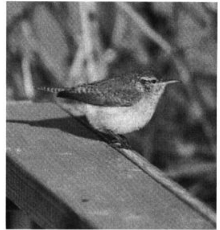
This lively Rock Wren provided a third state record for Michigan 21–30 October 2002 at L'Anse, Baraga County.