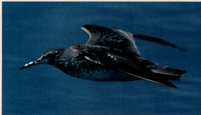
Gray-tailed Tattlers are regular in small numbers in summer on St. Paul Island, Alaska, where this bird was photographed 19 July 2002. Compare this flight shot's nice depiction of the tail pattern to the erroneous illustrations in several popular field guides.