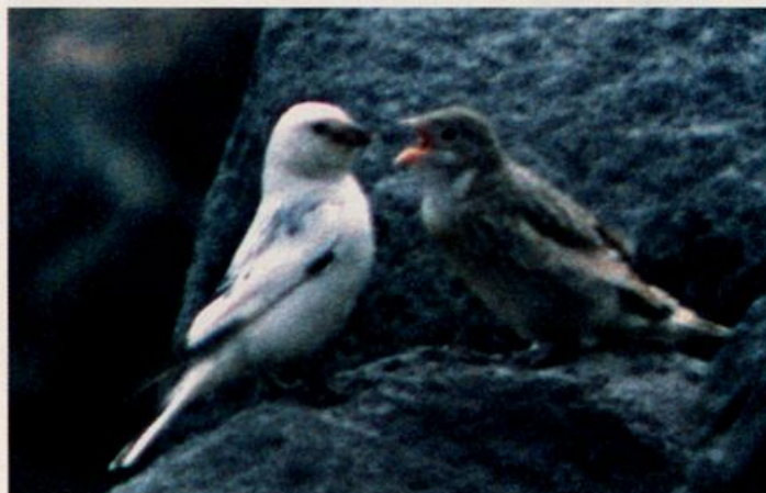
This female McKay's Bunting on St. Paul, first discovered 23 May 2002, was photographed 12 June feeding three young produced with a male Snow Bunting.