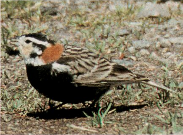
This male Chestnut-collared Longspur frequented a lawn at Tiverton, Long Island, Nova Scotia 10-19 May (here 16 May) 2002—an eighth provincial record, all but one of which have also been in the spring.