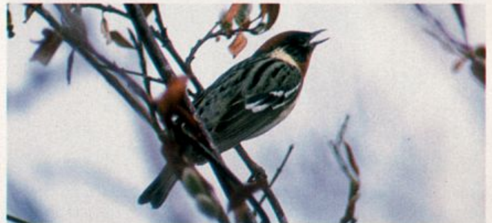
Providing only the second confirmed record for Churchill, Manitoba, this Bay-breasted Warbler was photographed there 13 June 2002.