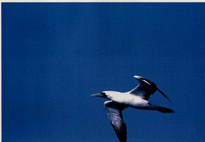
Irregular in appearances at the northern extreme of range here, Masked Booby had not been recorded in June off Hatteras, North Carolina in a few years. This adult was found in the Gulf Stream here 9 June 2002. In the western North Atlantic, there are no confirmed records of the species north of North Carolina.