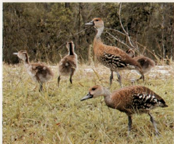
Breeding West Indian Whistling-Ducks are rarely documented in the northern Bahamas; this brood on Andros Island in June 2002 constitutes one of few confirmed records of breeding there.