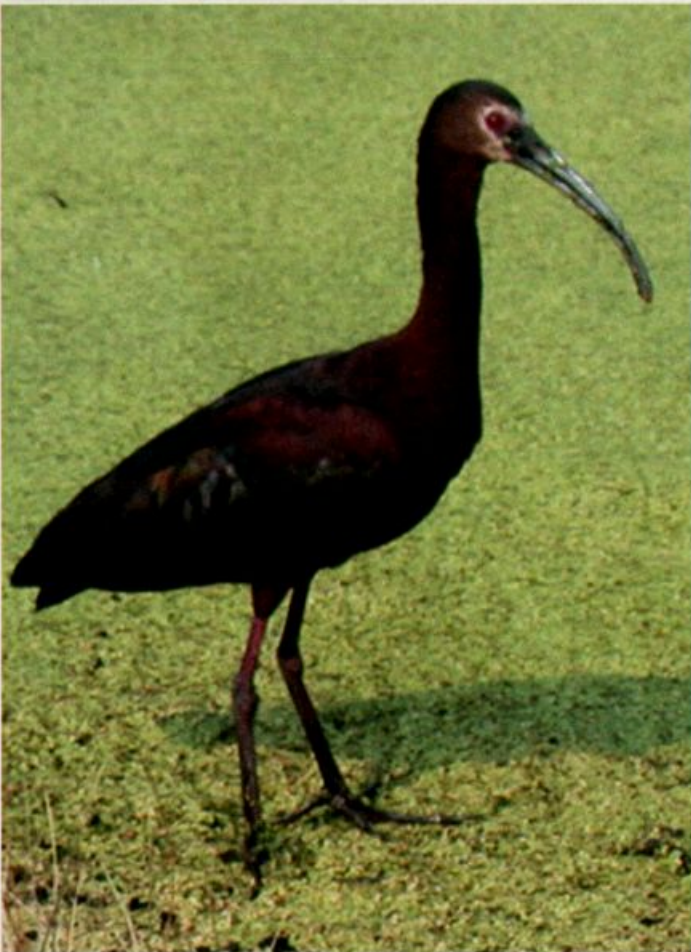
North Carolina had to wait a bit longer than neighboring states for confirmation of White-faced Ibis within its borders, but this obliging adult at Nags Head, Dare County and vicinity 28 June through 20 July 2002 should place the species on the state's Official list.