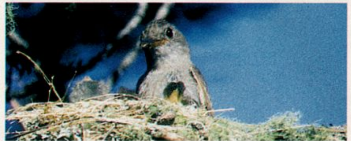
This nest of Greater Pewees was discovered near Mount Livermore in the Davis Mountains, Texas on 9 July 2002, providing Texas with its first breeding record. Singing Greater Pewees have been documented in the general area in four of the past five years, including one in the same area in 2001.