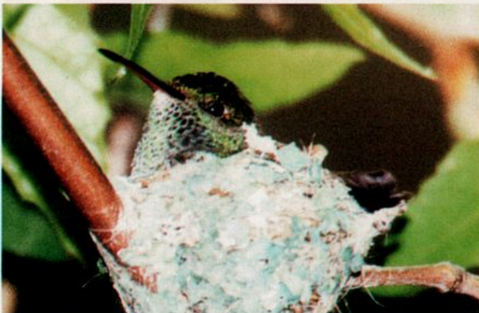
This female Berylline Hummingbird appeared at Ramsey Canyon 26 June 2002 and stayed to nest in July.