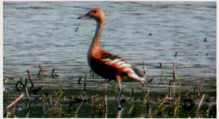
This unbanded Fulvous Whistling-Duck visited Grand Kankakee Marsh, Lake County, Indiana on 8 June 2002. This declining species makes fewer appearances away from the southeastern states and Texas than in decades past.