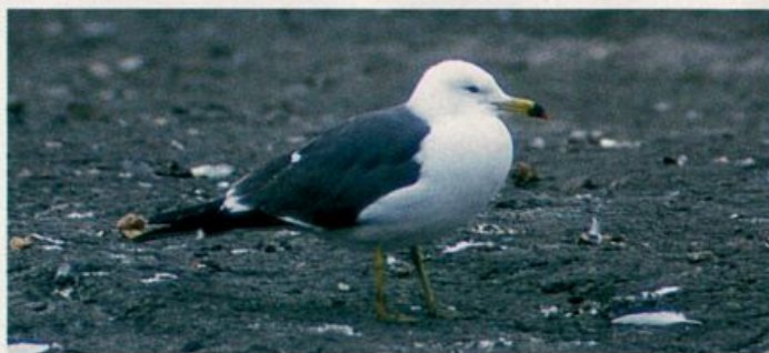
Bruce Mactavish's extended visit to the Inuvik area in Northwest Territories of Canada produced a number of interesting avian records this season, the most startling being this adult Black-tailed Gull at the Inuvik landfill 4 June 2002, which constitutes one of very few interior records for the continent.