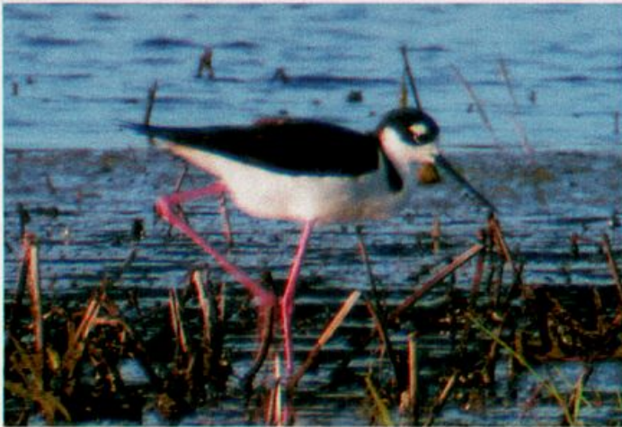
Black-necked Stilts, expanding across a broad front from the Pacific Northwest to the southern Canadian prairies, made headlines in Indiana this summer, with the discovery of several active nests and many wanderers—in a state where the species has been considered accidental. This stilt was one of two nonbreeders at Grand Kankakee Marsh, Lake County, Indiana 14-17 (here 15) June 2002.