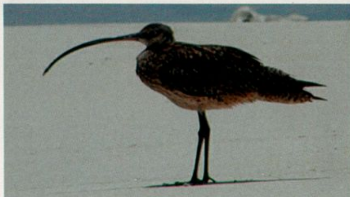
This Far Eastern Curlew was photographed on Disappearing Island, French Frigate Shoals, Hawaiian Islands National Wildlife Refuge on 10 June 2002.