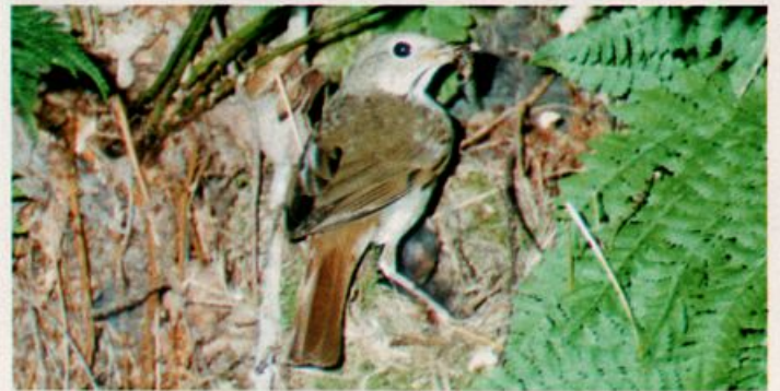
Searching for nests of low-density breeders in one's area can be a fine way to spend the season. At the Ritchie Ledges section of Cuyahoga Valley National Park, Summit County, Ohio, six Hermit Thrush nests were found, including this bird's nest 18 July 2002.