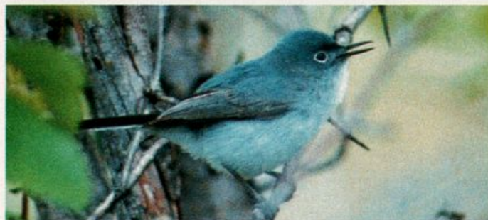
A Blue-gray Gnatcatcher remained from the spring season through at least 30 June 2002 at Hardy Canyon, Yakima County, Washington, but was unable to find a mate, despite construction of "a fine nest."