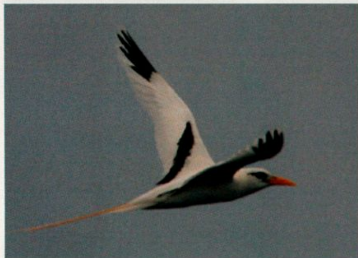
Providing one of few records for Georgia, this adult White-tailed Tropicbird was found on a pelagic trip off St. Catherine's Island 24 June 2002. Note the apricot wash to the tail.