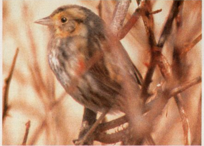
Canada's first Saltmarsh Sharp-tailed Sparrow was photographed 6 April 2002 at the "Winter Sparrow Oasis" at Daniel's Head, Cape Sable Island, off Nova Scotia, among many Nelson's Sharp-tailed Sparrows, Savannah Sparrows, and a very rare Seaside Sparrow.