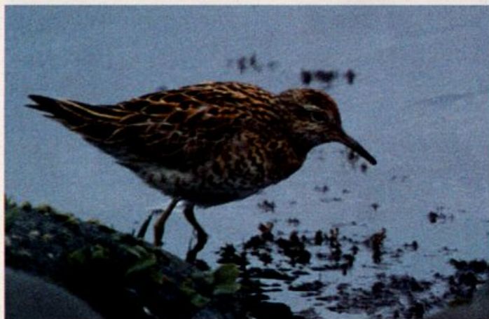
The only Sharp-tailed Sandpiper at St. Paul Island, Alaska all summer was this adult at East Landing and the Salt Lagoon 27 July 2002.