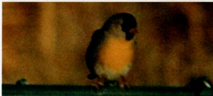
In a season of stunning finds in Texas, this adult male Lawrence's Goldfinch at Guadalupe Mountains National Park 5 (here) to 7 June 2002 may have been tops—an unexpected first summer record for the state. Previous records of this species in Texas have all been part of winter invasions.