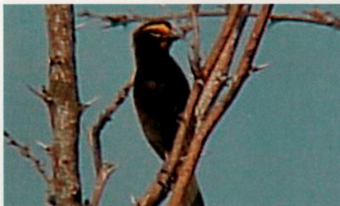
This male Yellow-faced Grassquit, the second for Texas, defended a territory at Bentsen—Rio Grande Valley State Park 8-29 June 2002. During that time, it also constructed a nest but not surprisingly did not attract a female.