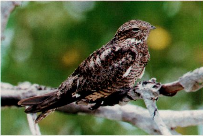
In the A.B.A. Area, most birders see Antillean Nighthawks on Florida's Keys, where they emerge in the late afternoon to hunt insects; few are privileged to see the species at rest, when its contrasting pale tertials, a distinction from local Common Nighthawks, can be seen well. This bird's white throat patch means that it is probably an adult male; it was photographed 8 June 2002 at Sugarloaf Key.