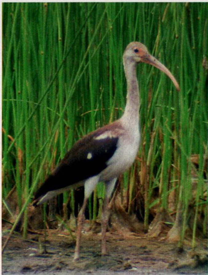
An immature White Ibis at the Nature Conservancy's Kankakee Sands wet prairie 25-27 June 2002 was Indiana's first in seven years.