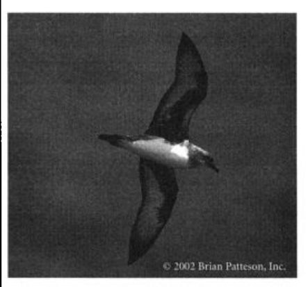
For more information contact