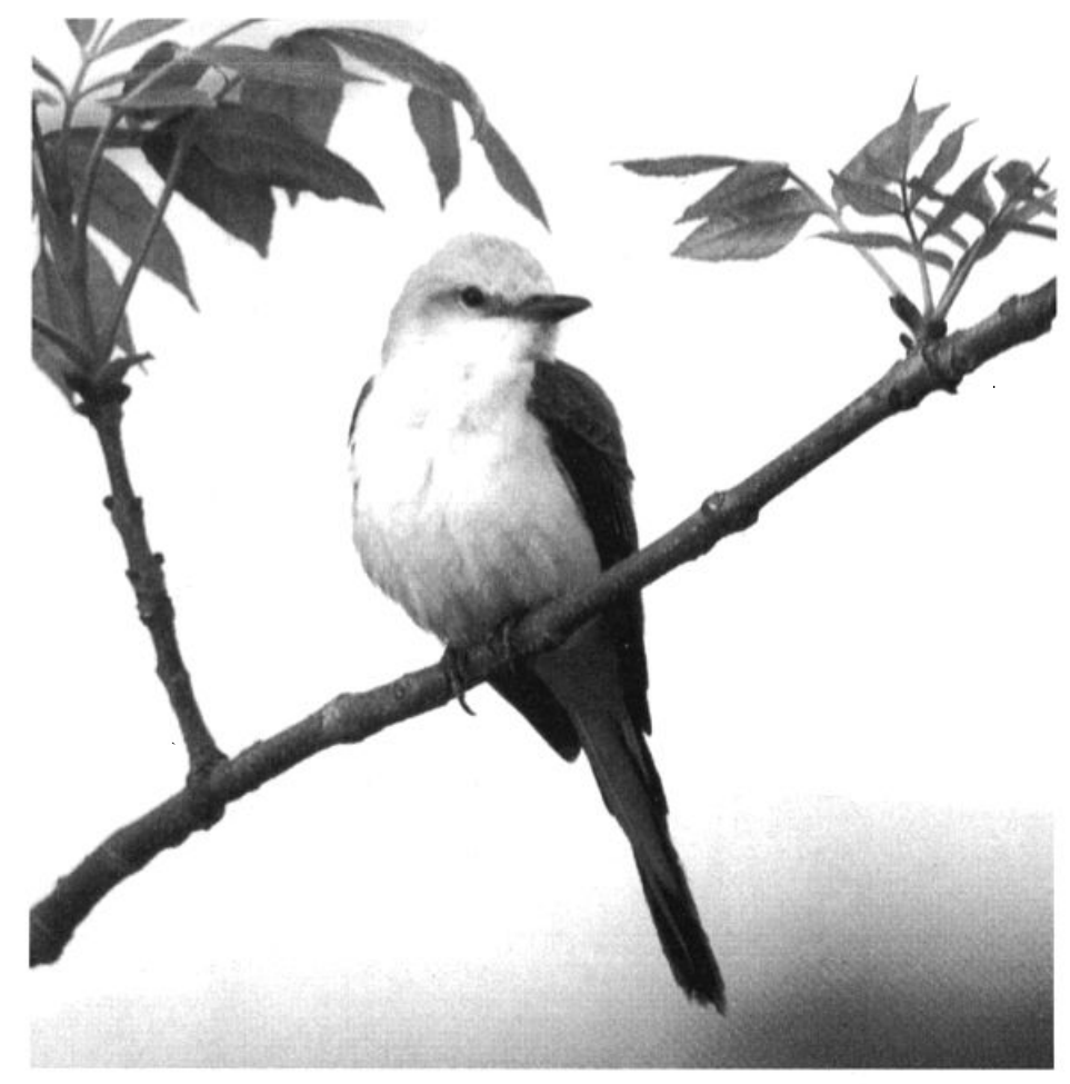
This Scissor-tailed Flycatcher appeared at Cap Tourmente 3-4 June 2002, one of two present in the province this season.

of some of the above-mentioned ducks so far away from their regular breeding range.