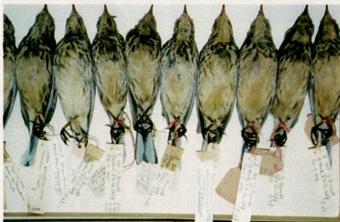
Figure 11. American Pipits of the subspecies pacificus in the collection at Museum of Vertebrate Zoology, Berkeley. The comparatively light streaking (almost spotting) of these birds never coalesces into a longitudinally "striped" appearance below, nor is the contrast with the underparts quite as strong as in Siberian.