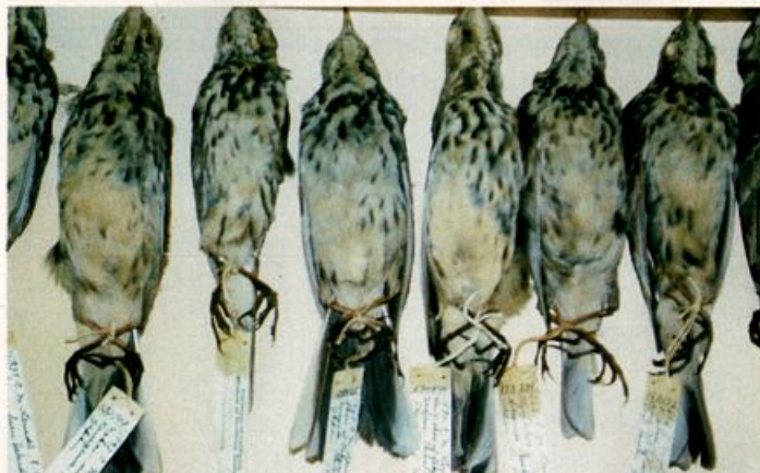
Figure 10. Siberian Pipits in the collection at the Museum of Vertebrate Zoology, Berkeley. Note the heavy ventral streaking (almost striping) in all individuals, all of which are in basic plumage.