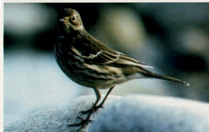
Figure 8. This photograph depicts a Siberian Pipit with fairly strong contrast between dark brown upperparts and whitish underparts, which in turn contrast with dark streaking below. The streaks of the underparts coalesce longitudinally, giving the bird a striped appearance. The white tips to the median coverts contrast not only with the dark upperparts but also with the slightly buffy greater median coverts, a common feature in Siberian Pipits. Photographed 15 December 1996 in Japan.