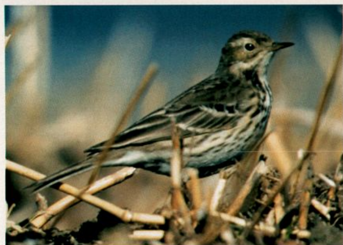
Figure 7. This Siberian Pipit tends toward the pale end, and the eye-ring is not especially pronounced, but other characters indicate Siberian. Photographed in Japan in winter, date unknown.