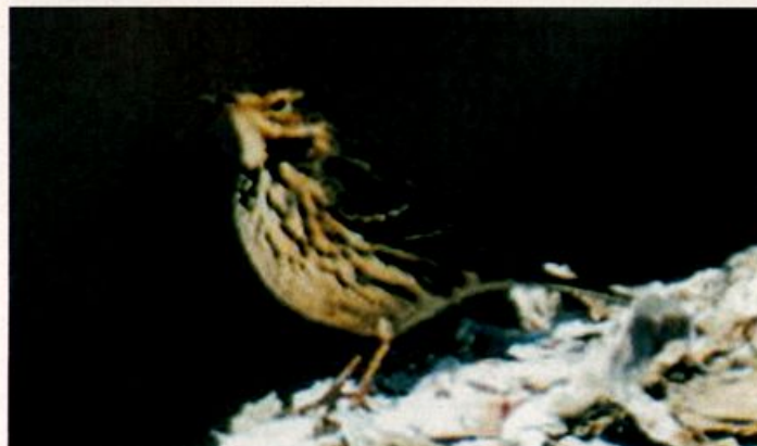
Figure 9. Though a bit soft in focus, this photograph captures all of the features of Siberian Pipit nicely: the very dark streaks below, darker than the upperparts' color, extend noticeably along the flanks. The streaks below the malar come together and flare to the side of the neck, similar to Richard's Pipit ( Anthus richardi ). Photographed 15 January 1993 in Miyagi Prefecture, Japan.

The breeding and wintering ranges of the four subspecies of Buff-bellied Pipit are poorly understood owing to difficulty in subspecific identification.