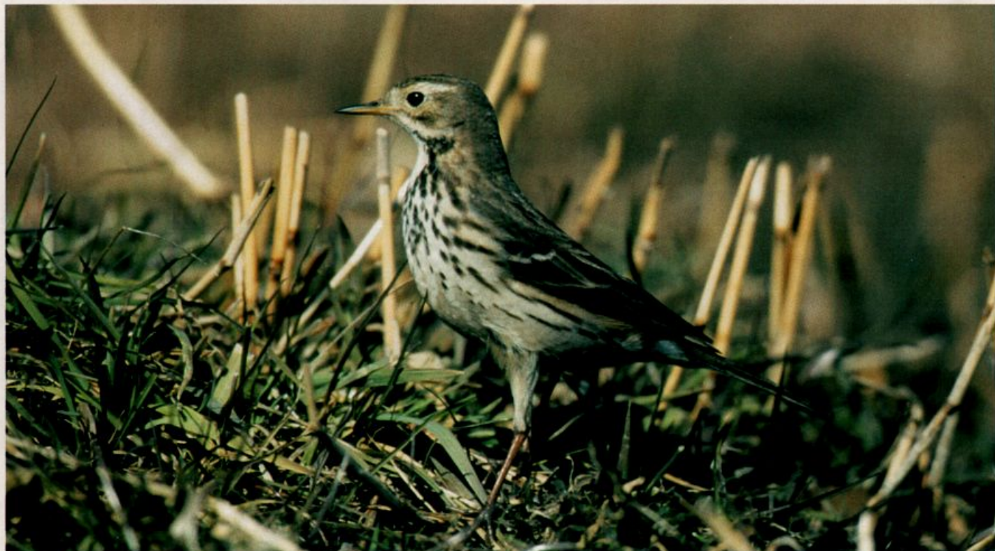
Figures 4. This typical Siberian Pipit shows the flaring submalar stripe, heavily streaked underparts (especially the sides), white underparts, white eye-ring, white median coverts, and pale legs. Though a bit paler than some individuals (cf. Figs. 8, 9), the bird is typical in other respects. Photographed along the Tamu River, Tokyo, Japan 31 January 1998.

Siberian Pipit is a vagrant to Europe, the Middle East, and along the Pacific coast of North America, whereas American Pipits vagrate to western Europe ( rubescens ) and are possibly rare winterers in eastern Asia ( pacificus ). In greater detail, however, the vagrancy patterns of Siberian and American Pipits are poorly known, as there is a gap in the literature regarding the subspecific identification of the members of the Buff-bellied Pipit complex. To our knowledge, the only recent sources to address the complex are Parkes (1982) and Phillips (1991). However, both sources focus primarily on identification of the three American subspecies in alternate plumage. Alström and Mild (1996), Lewington et al. (1991), and Beaman and Madge (1998) discuss the identification of Siberian Pipit in relation to the rubescens subspecies of American Pipit but do not address the degree of plumage variation within American Pipit subspecies. This article attempts to remedy these gaps in the literature.