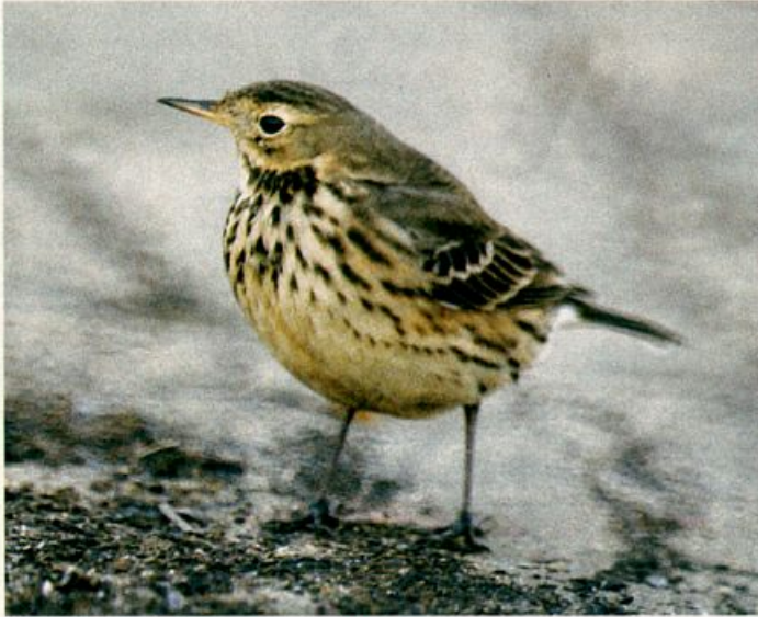
Figure 12. American Pipit, presumably of the expected eastern subspecies rubescens , at North Beach, Maryland, in winter. The buffy underparts, somewhat sparsely streaked sides, the lack of a flaring, dark submalar stripe, the buffy wing-bars, and the gray legs rule out Siberian Pipit.