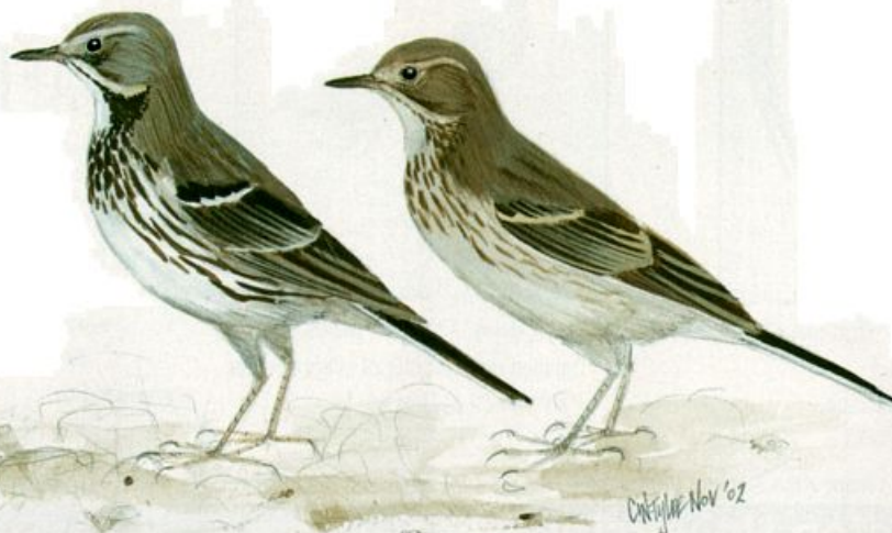
Figure 3. Field-based sketches of a Siberian (left) and American ( A. r. pacificus ) Pipit (right) seen on 23 November 2001 near Perris, California. Illustration by Cin-Ty Lee.