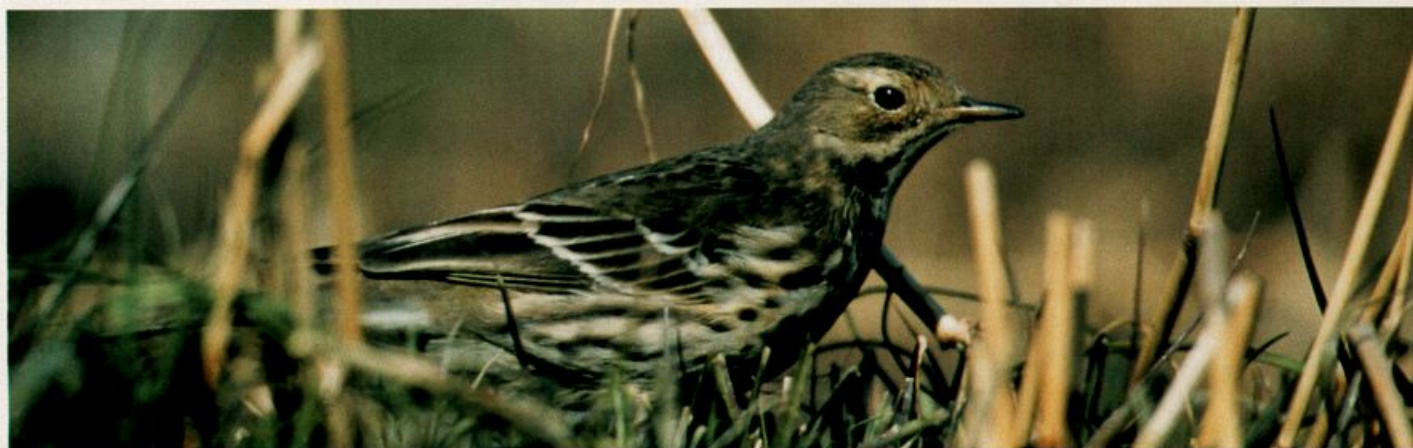
Figure 5. The same Siberian Pipit as in Figure 4, showing the eye-ring and wingbars to better advantage.