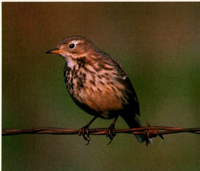
Figure 13. American Pipit, presumably of the expected western subspecies pacificus , photographed in California in winter. This bird is clearly distinguishable from Siberian Pipit by its paler streaking below (as well as the spotted appearance of the upper breast), the lack of a bold and flaring submalar stripe, the lack of strong eye-ring, the gray legs, and the relatively buffy underparts. The more oval or roundish breast spots of pacificus differ slightly from the more elongated breast spots on alticola and rubescens (cf. Fig. 12). Photograph by Jim Gain.

The Siberian Pipit ( A. r. japonicus ) breeds in central and eastern Siberia from Tunguska to Kamchatka and south to northern Sakhalin and the Kurile Islands (Gabrielson and Lincoln, 1959, Dement'ev and Gladkov 1970, A.O.U. 1989). It is not thought to breed in Alaska (A.O.U. 1991).