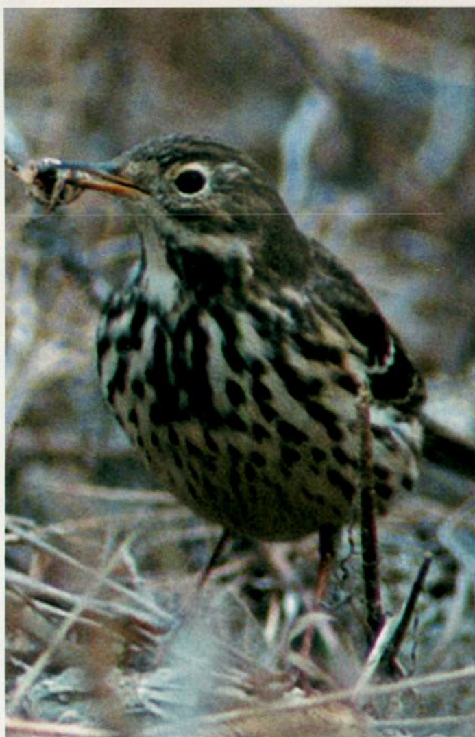
Figure 6. Another Siberian Pipit, photographed 1 December 2001 in South Korea. They eye-ring is well-defined, likewise the coalescence of dark streaks below the malar area and the starkly marked underparts against a whitish background.