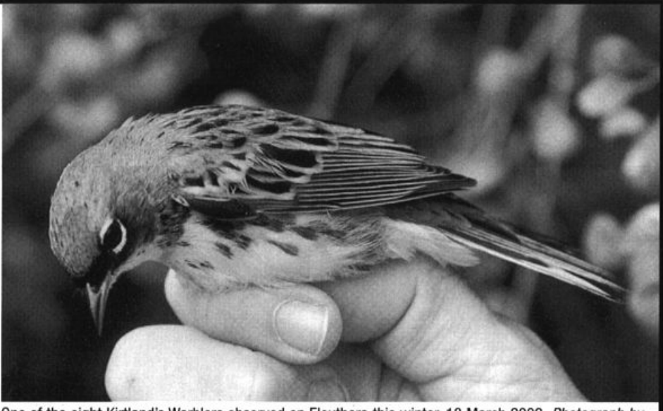
One of the eight Kirtland's Warblers observed on Eleuthera this winter, 18 March 2002.

A Mississippi Kite over Nonsuch I. 20 May (DBW; vt. EA) was the first record for Bermuda and the farthest recorded from contunental landmasses; it apparently crossed to Cooper's I. and was possibly seen later in the day over the Hamilton Harbour Is (SR, DW). Two Bald Eagles photographed over Marsh Harbour, Great Abaco 13 Mar were the first confirmed record for the Bahamas (RP). A Red-tailed Hawk (DW) was over Morgan's Pt.