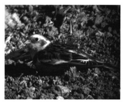
Arizona's second Snow Bunting was at Thatcher 11 to 20 April (here 12 April) 2002.