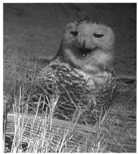
Part of a very broad invasion that brought individuals as far south as Texas, this Snowy Owl north of Lake Holbrook in Otero County, Colorado 17 March 2002 was one of at least four still in the state in the spring season 2002.

W H.R. 1 May (CLW, JB) and the other at L.P. 18 May (SJD, JBF). A Worm-eating Warbler was at Casper 5-6 May (B&DW, JL). A male Connecticut Warbler was at W.H.R. 18 May (CM, JL, GL, SJD, JBF), and a male Hooded Warbler was at E.K.W. 30 Apr—4 May (CM) and a female there 15-19 May (CM, HS, SJD).