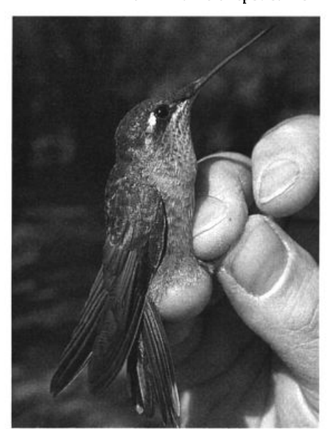
A rare vagrant so far north, this female Magnificent Hummingbird graced the Chico Basin Ranch in El Paso County, Colorado 18 May 2002, where it was banded.

A singing Eastern Wood-Pewee was in Baca 10 May (JK). An Alder Flycatcher was banded at C B.R. 18 May (NG, TL, ph. LS). Gray Flycatchers in Wyoming included one at H.P.R.S. 1 May (CLW, JBn) and one at W.H.R. 1 May (CLW, JBn). Black Phoebes in Colorado were reported from