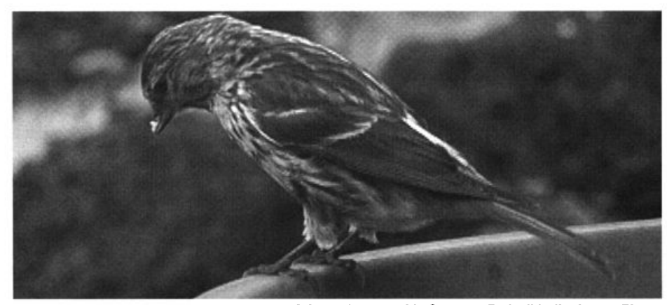
Perhaps the most unpredictable occurrence of the spring was this Common Redpoll in the Lower Rio Grande Valley at Laguna Vista, Cameron County. Not only was the location unexpected, but it was present 28 (here) to 30 May 2002!