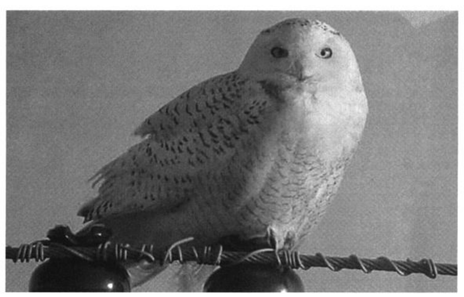
This Snowy Owl found just west of Abilene was just the fourth ever documented in Texas. It was discovered on the moderately late date of 22 March (here 23 March) and remained into early April.