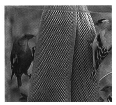
Part of a multi-regional influx was the Whitewinged Crossbill at Bartlesville, Washington County, Oklahoma 17 April 2002.