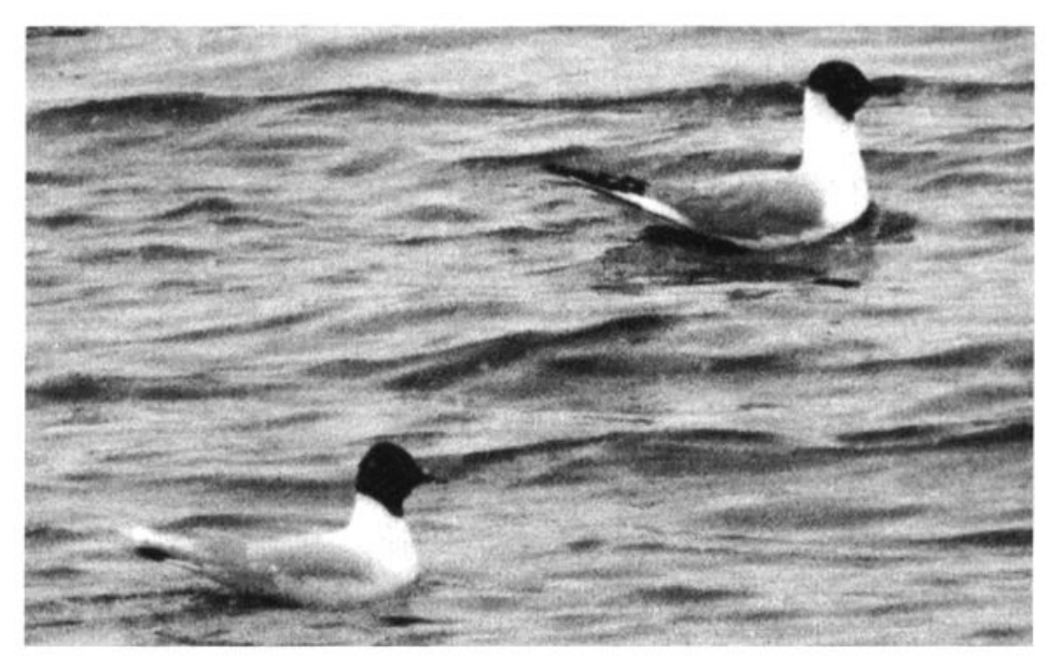
This adult Little Gull (at left) near Irricana, Alberta 4-10 May 2002 (here 5 May) provided one of fewer than 10 records for the province.

SA Passerine migration was severely disrupted by the cold spring. Heavy mortality was noted, especially in s. Alberta; elsewhere, crows were seen preying on weakened passerines. Breeding Bird Surveys may reveal the extent of the damage. Early arrivals such as lone Say's Phoebes near Condie Res. 6 Apr (BL) and at Underhill, MB 13 Apr (DH), and a Barn Swallow at Windygates 13 Apr (RK, BC), were surely doomed. Tree Swallows undoubtedly suffered heavy losses as one cold storm after another crossed the Region. Many observers noted Catharus thrushes grounded in large numbers for much of May. The warbler migration was spectacular, not for rarities, but for the sheer numbers of grounded and lingering birds. Many resorted to groundlevel and over-water feeding, or were forced to subsist on cankerworm and tent caterpillar eggs. Daily counts were often 5–10 times the norm.