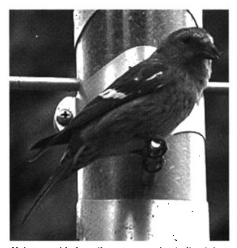
Alabama added another new species to its state list this spring when this White-winged Crossbill was discovered in Lauderdale County on 26 April 2002 (here 7 May).

good showing, with 263 on 26 Apr from C.H.F. (MM, DC) providing the highest count ever from nw. Arkansas and 1329 on 7 Apr providing an outstanding total from Ensley Bottoms, TN (JRW). Dunlin numbers peaked at 1700 on 4 May in Acadia and Vermilion, LA (JPK, MaG). A very cooperative Curlew Sandpiper was found on 28 Apr in Acadia, LA (CW, JW, DFL). The bird was seen by many at the same location through 3 May. The same or a different bird was spotted in Vermilion, LA about 16 km away on 6 May (ph. PC, DP, m. ob.) and was seen through 11 May at that location. Stilt Sandpipers numbering 1600 in Acadia and Vermilion, LA 2 May provided good company for the Curlew Sandpiper. Providing only the 3rd spring record for nw. Arkansas were 2 Buff-breasted Sandpipers at C F.H. 17 May (JN, DC, MM). These were preceded by a good count of 60 on 11 May in Vermilion, LA (JPK, JK). A Ruff in Lowndes, AL 17 Mar (LFG, P&RJo) provided the 5th state record. Short-billed Dowitcher numbers peaked at 2500 on 2 May in Acadia and Vermilion, LA (JPK, JG), and Long-billeds peaked at 4830 in Acadia 27 May (JPK, KF). Two Red-necked Phalaropes showed up in Arkansas on 19 May, a male near Texarkana (CM) and a female in White (KN, LN).