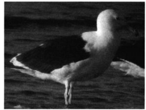
This adult Kelp Gull was one of five found 28 September 2001 at Costa del Este, on the outskirts of Panama City; one of them remained until at least 5 December. These birds were the first of this species ever reported in Central America, but its appearance was anticipated, given the rash of recent records from the northern and southern Caribbean and Gulf of Mexico. (If only more tropical travelers would check the local gulls!)

A Caribbean Dove heard near Nova S.F. 16 Dec (LJ) was the first documented from mainland Belize. They are rumored to be in n. Corozal District, an area that is seldom birded, but no specific records have surfaced. Two Mourning Doves were near Big Falls, Toledo 19 Dec (LJ). This species is an uncommon fall migrant but rare in winter in s. Belize. The Common Ground-Dove is also a rare fall and winter stray in s. Belize, so 6 in separate areas on the Punta Gorda C.B.C. 19 Dec (m. ob.) were quite unexpected. A female Maroon-chested Ground-Dove at Cerro el Pital, Chalatenango 27 Dec (GMGD *K.U.N.H.M.) was only the 2nd reported from El Salvador; however, it is found just across the border in Honduras and was expected to occur at this site. Two Yellow-headed Parrots along the