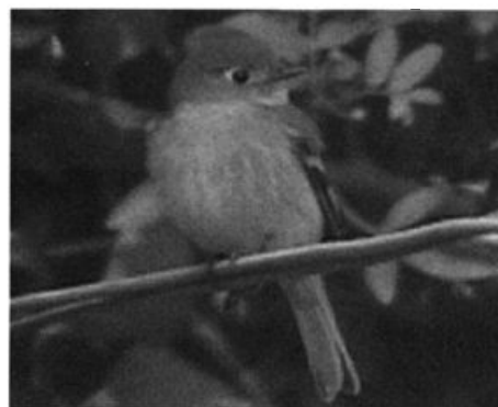
Baja California's first wintering Hammond's Flycatcher at Ensenada, B. C., was among numerous highlights of the Region's inaugural Christmas Bird Count, held on 4 January 2002. This bird had been present here since 3 December.

Seven Summer Tanagers (5 in B.C., 2 in B.C.S.) was a healthy sum, particularly compared with a paltry 3 Westerns in B.C.: Ensenada 4 Jan (†RAH) and 2 at Cantamar 5 Jan (DSC, MSM). In B.C.S., Western Tanager counts of 2 at Guerrero Negro 2 Jan and one at Loreto 3 Jan (both MJI), 9 at Mulegé 27 Jan, 9 at Ciudad Constitución 28 Jan, and 10 at San Isidro 3 Feb (all JEP, DSP) suggest a wider winter distribution than previously known. Four Chipping Sparrows at San Javier 1 Jan (MJI) were in B.C.S., where the winter status is unclear, while a Brewer's Sparrow on the Maneadero Plain 4 Jan (†GMCC, PAG) and 3 Clay-colored on the San Quintín Plain 24 Jan (JEP) were extralimital. Two Sooty Fox Sparrows at El Rosario 24-25 Jan (JEP) were as far s. on the peninsular mainland as this