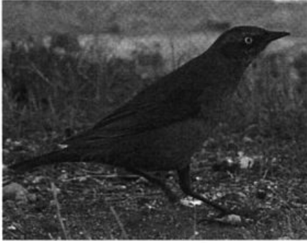
One of two recorded this winter in the Region, this Rusty Blackbird was photographed on San Clemente Island on 14 February 2002.