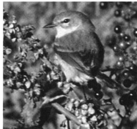
Lemon Tank's fresh water is the only source on San Clemente Island, so it's a good spot to wait for vagrants such as this Prairie Warbler, which stayed here from October through mid-December 2001.

A Northern Goshawk at C.L. 16-31 Dec (BSh) was only the 2nd in e. Kern. One Harris's Hawk was still present from the 1994 incursion at Borrego Springs, San Diego at the end of the period (RT), and another was near Warner Springs, San Diego 17 Dec (BSie). The Broad-winged Hawk that arrived on San Clemente I. 31 Oct remained through the period (BLS). A Swainson's Hawk at V.C.G.P. 25 Jan+ (WW; ph.) and another over Lake Forest, Orange 16 Dec (JEP) were evidently wintering locally, but one near El Centro, Imperial 15 Feb (KZK) was an early spring migrant followed by at least 4 more in the next two days. Single Zone-tailed Hawks were along the coast in Santa Barbara/Goleta (DMC), San Clemente/San Juan Capistrano (DRW), and Escondido (MUE) throughout the period, an imm. was in the Upper Ojai Valley, Ventura 6 Jan (BSil), an ad. (returning?) was at nearby L. Casitas 12-17 Feb (TT, DPe), one was at Laguna Niguel, Orange 29 Jan (VL), and another was near Mesa Grande, San Diego 17 Dec (BSa); farther inland, single ads. were at Blythe 1-2 Dec (RHl),