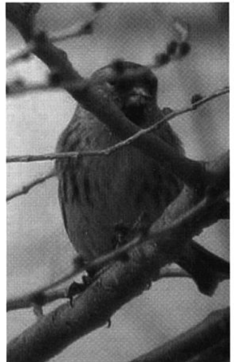
This Common Redpoll was at Crow Valley Campground, Weld County, Colorado, on 27 January 2002, part of a major exodus of the species from parts north.

Dec—28 Feb+ (DN, m. ob.), at Two Buttes Res. 19 Dec and 2 Jan (DAL), at Vineland, Pueblo 23 Dec (DJ), and at Lamar 2 Feb (DAL) North of normal, a Curve-billed Thrasher was observed nw. of Windsor, Weld, 11 Nov—2 Feb+ (MMA, m. ob.). Bohemian Waxwings were seen in flocks of several hundred in Rio Blanco 2 Dec—16 Jan (DH), and about 300 were seen in Boulder, 2 Feb (BSc).