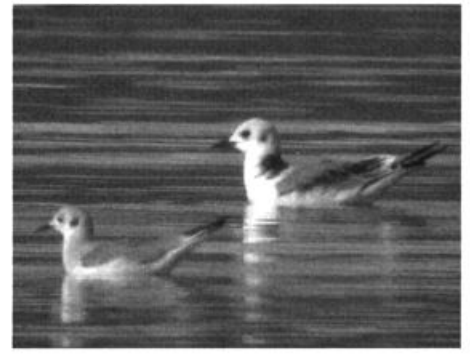
This juvenile Black-legged Kittiwake (right; with a Bonaparte's Gull) was at Chatfield Reservoir, Colorado on 2 December 2001. Records of this species from the continent's interior are increasing, as more and more birders make regular trips to scope large reservoirs in all seasons.

Three Eastern Bluebirds were at Bessemer Bend, Natrona, WY 21 Jan—28 Feb (CEM, HS, J&GL). A Mountain Bluebird was near Gypsum, Eagle 5 Dec (JMe), 7 at Two Buttes Res. 19 Dec (DAL), and 2 at Bonny Res. 5 Jan (SSe). Single Hermit Thrushes were in Canon City 1 Dec (SMo) and Ft. Collins 9 Dec (DAL). Varied Thrush reports included one in Durango, La Plata 22 Dec—2 Jan (KSt, m. ob.), one in Boulder, 23 Dec—1 Jan (BK, TL, LS), and one at Crosier Mt. Trail in Drake, Larimer 21 Dec (RDi). A Gray Catbird was in Pueblo 10-15 Dec (BKP), and one to 2 were at Two Buttes Res. 19 Dec and 2 Jan (DAL). A Northern Mockingbird was at Casper, WY 15 Dec (DW), with 7 in Colorado this season. Single Brown Thrashers were at Ft. Lyon 23