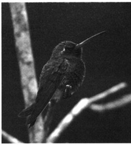
This striking male Broad-billed Hummingbird, originally discovered on 18 October 2001, spent the winter in suburban Houston, Texas. This species occurs almost annually in the state, although most often in the western half.