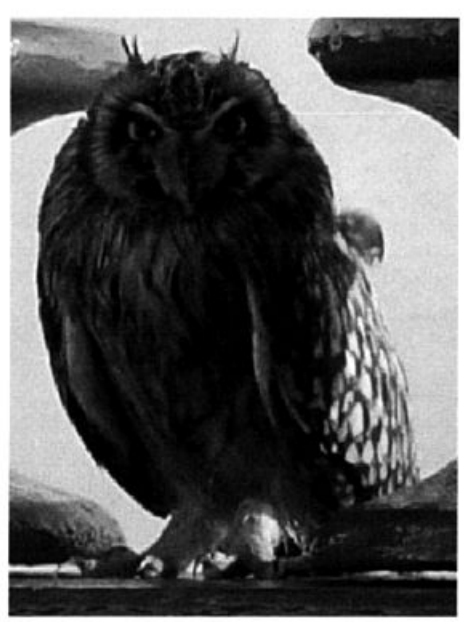
This Short-eared Owl landed on the ship North Star while, it was under way at 25.7° N, 50. 2° W, or about 1577 km east of Antigua, 11 November 2001, it had been seen the day before in flight. Although known to make water crossings readily, this species has rarely been recorded so far out at sea in the Atlantic Ocean. The bird departed the ship on the 12th, heading eastward ( fide Hubert Hall).

On Bermuda, 36 warbler species were reported at least once Aug-Nov (all but Townsend's and Cerulean Warbler): among the more interesting records, a Golden-winged Warbler 15 Sep at Horseshoe Bay was the only 2001 report (DW), and a Palm Warbler 7 Sep at Ferry Reach was the