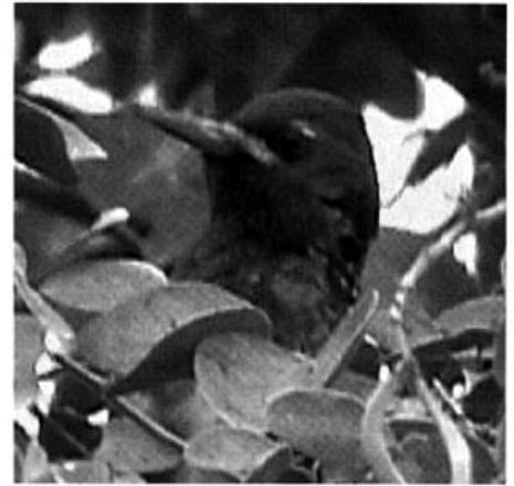
This Red-breasted Sapsucker at Bahía Tortugas 7 October 2001 was the first for Baja California Sur.

Six Blackburnian Warblers at coastal locations