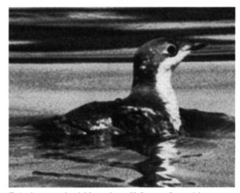
This Long-billed Murrelet off Santa Cruz 23 August 2001 represents the southernmost record of this Asian species on the eastern Pacific Coast. Detections of Long-billed Murrelet are increasing in the Region, a pattern likely related to observers' increased awareness of characters separating this species from the closely related Marbled Murrelet.