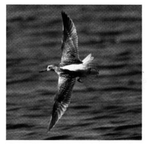
This juvenile Common Greenshank spent almost three weeks associating with both yellowlegs species at the mouth of the Mad River in Humboldt County, thrilling visitors from across the country 27 August-15 September 2001.

An imm. Snowy Egret at Trinity L. 18 Aug-2 Sep was the 2nd for Trinity ; a Cattle Egret there 12 Sep was a county first (both SAG, m. ob.). A late