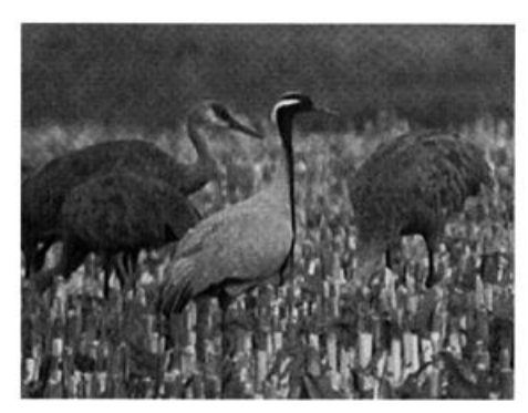
A long way from home, this adult Demoiselle Crane at Staten Island, San Joaquin County, sparked extensive debate about whether this Eurasian species could occur as a natural vagrant in North America.

Chicago Marsh, Santa Clara 19 Aug (MJM) and Bodega Bay, Sonoma 9 Sep (BDP, AWgh) attempted to overwinter, remaining into Dec