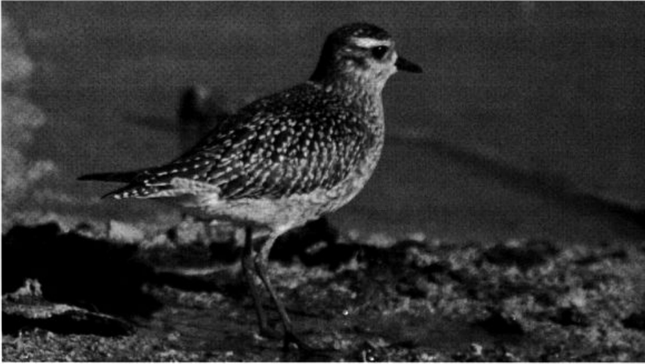
Any golden-plover in the Great Basin is notable. This bird, first located at Fish Springs N.W.R., Juab County, Utah 21 October 2001 (and photographed there on the final day of its stay, the 28th), was determined after some discussion to be a juvenile American Golden-Plover.

Nov (AW); Utah reports included 2 at Draper, Salt Lake 15 Nov (SA) and a good 24 at La Verkin Cr., Washington 23 Nov (SS et al.). A Blue-winged Teal at B.R. 20 Oct (DT) was the only report. A Eurasian Wigeon was a nice find at E.S.N.W.R. 31 Oct (JG). A Greater Scaup was at P.L. 20 Oct-13 Nov (v. o.), and 3 were at S.L. 21 Nov (JW). A Long-tailed Duck put in an appearance at A.I.C. 3 Nov (TJ). Scoters went unreported in Nevada, but they made a nice showing in Utah: 2 Black Scoters were at M.R. 27 Oct (LW), and one was at H.R. 3-11 Nov (v. o.); single Surf Scoters were found at an impressive five locales 20 Oct-17 Nov (v. o.); and White-winged Scoter reports included a single bird at M.R. 27 Oct (LW) and up to 3 at H.R. 3-29 Nov (v. o.).