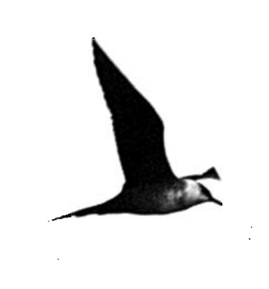
This Long-tailed Jaeger, Colorado's seventh, was at Standley Lake, Jefferson County, well photographed on 23 August 2001.