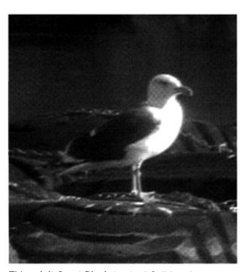
This adult Great Black-backed Gull has been showing up every winter since 1993 at Pueblo Reservoir, Pueblo County, Colorado. It was photographed on 15 December 2001.