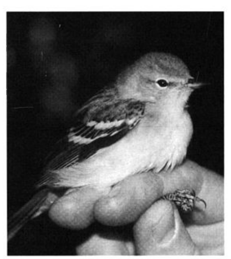
A good capture at the Idaho Bird Observatory was this first-fall female Bay-breasted Warbler, which provided Idaho's fourth record. It was banded by Jay Carlisle on 13 September 2001.

Black Swifts 10 Sep (FV), where they are now nearly annual.