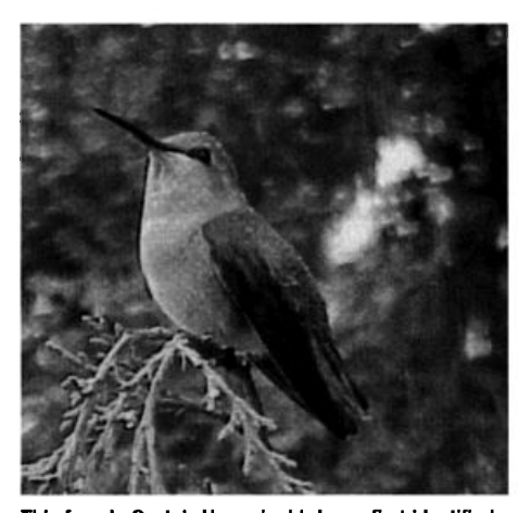
This female Costa's Hummingbird was first identified at Donna Hosko's home near Corvalis, Ravalli, Montana on 25 October 2001 and was last seen there on 20 November. This bird furnished a first record for Montana and the Region.

A surprising total of 6 Band-tailed Pigeons strayed to Idaho 12 Aug-23 Sep. Eurasian Collared-Doves continued to explore Idaho. At least one remained in Power 20 Oct (CT), while another 3 were discovered in Cassia 20 Oct-30 Nov+, and one was found in Cassia 17-30 Nov+(RL). Especially rare in autumn was a Yellow-billed Cuckoo in Canyon 11 Sep (MJ). Owl captures at I B. O. turned up 17 Flammulated, 2 Northern Pygmy-, one Long-eared, and 159 Northern Sawwhet Owls 29 Aug-28 Oct, significantly more than last year. Also noted at I. B. O. were 3 migrating