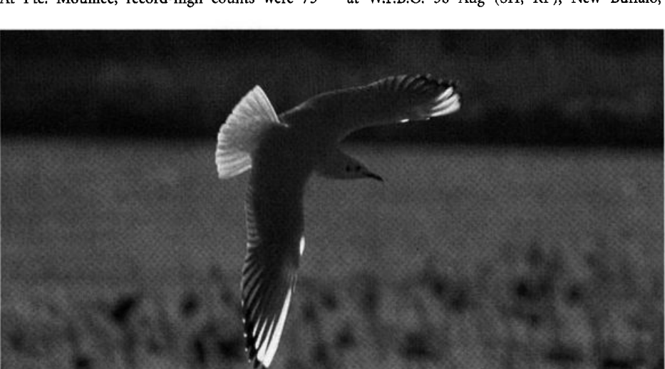
On 6 October 2001, a Black-headed Gull, a species rather rare away from northeastern coasts, turned up at Spirit Lake in Jackson County, on the Minnesota-lowa border; this is the fourth October in a row for the species here. Birders away from the Atlantic coasts are finding the lakes and rivers in the interior productive for this and indeed virtually any gull species. This photograph was taken 24 October.