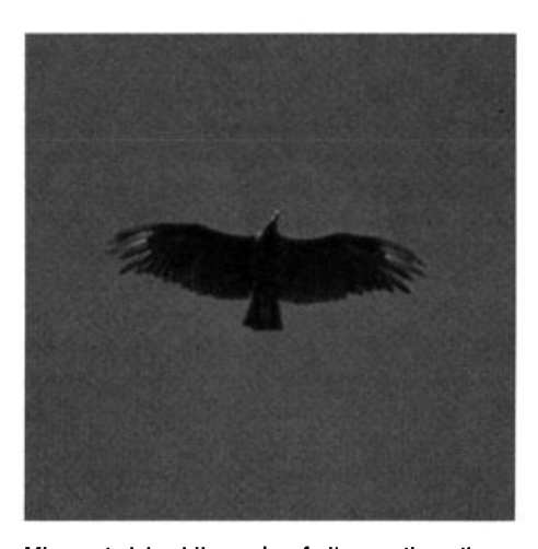
Minnesota joined the ranks of other northern tier states when this Black Vulture, a state first, flapped and sailed by the Hawk Ridge hawkwatch site at Duluth on 28 August 2001.