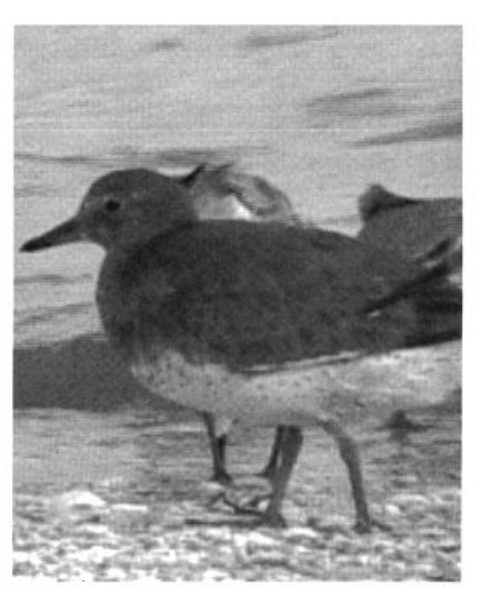
Providing only the third verifiable record for Florida (and third record for any eastern state!) was this Surfbird at Sanibel Island 26-28 October 2001 (here 27 October).

SA Florida's first Elegant Tern was recorded at Honeymoon I. 3 Oct-22 Nov 1999, while another of the species was discovered the following winter (2-29 Dec 2000) at Ft. De Soto, about 50 km to the south. This past spring, presumably the same Elegant reappeared at Ft. De Soto and was observed copulating with a Sandwich Tern (cf. N. A. B. 55: 382); Florida's primary Sandwich Tern colony is nearby. This fall, 3 Elegant Terns were photographed at Ft. De Soto, although whether all of them were "pure" is uncertain at the time of publication. The following information is a brief summary of these observations; readers are referred to Lyn Atherton's website for additional details: <a href="http://home.earth-">http://home.earth-</a> link.net/~bonniedabird/FirstElegant.htm >. On 17 Aug, 2 terns were seen at Ft. De Soto, one carrying a fish while being pursued by a second, begging bird. A dusky-tailed subad, was photographed here 21-22 Sep, while a white-tailed ad. was photographed the following day. Finally, an "obvious HY [Elegant x Sandwich Tern] hybrid" (!) was photographed at Cortez Beach, Manatee 9 Oct. We will continue to monitor this fascinating situation.